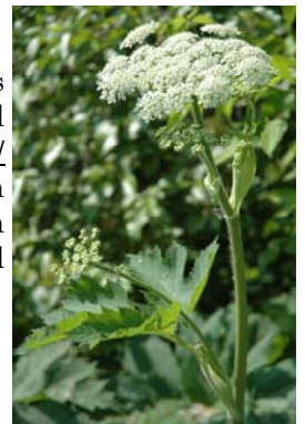
Photo of Cow Parsnip.

For more identification tips, watch this video from the Invasive Species Council of Metro Vancouver http://tinyurl.com/HogweedVsParsnip . Please note, both Cow Parsnip and Giant Hogweed can cause burns, so it's best to avoid touching either of these giant Apiaceae .