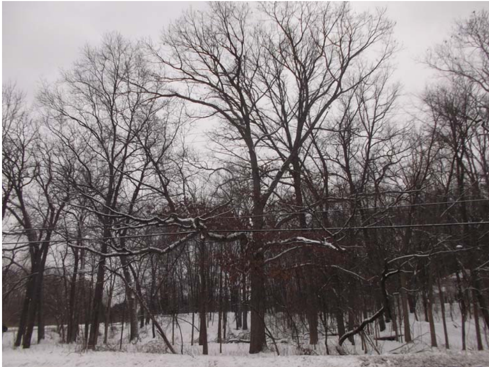
Oakridge Nature Area in winter

After just one visit to Oakridge, I was completely sold on its beauty and importance in our community.