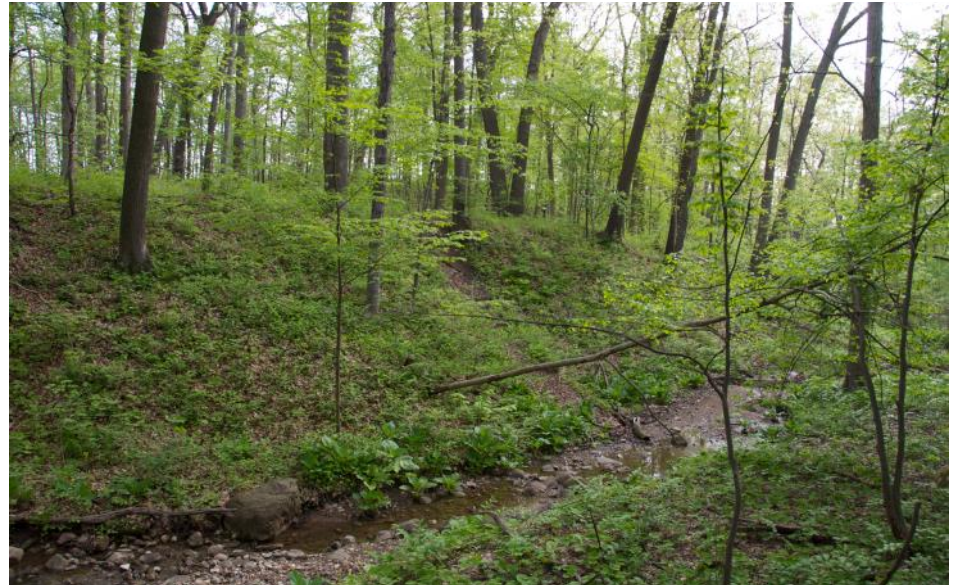
The forested ravine at Kuebler Langford Nature Area

Past the entrance just off West Huron River Drive, the earth is a faded scar. Used as a staging area in the 1970s for the construction of the bend in M-14, the topsoil was scraped off to build the overpass, while the remaining earth was compacted into a sandy, gravelly plate. While you can still see patches of the hard, bare earth, most of the ground is now hidden under the feathery blanket of prairie grasses and wildflowers. Last fall, we burned the prairie to spur new growth of native plants,