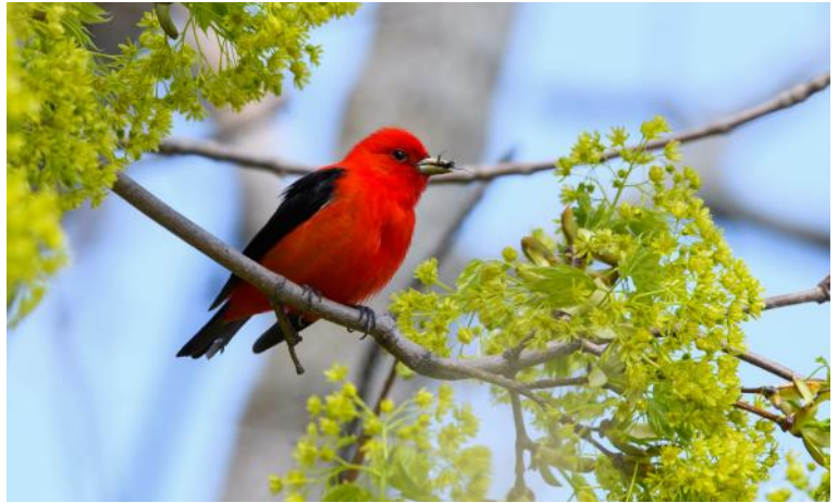
Male Scarlet Tanager

Follow me to Bird Hills Nature Area, Ann Arbor's largest nature area, which overlooks Huron River Drive near Barton dam. On a clear early morning in May, we hear a varied chorus of bird song. There's a cacophony of sound now, more than we can process, so we breathe for a few minutes and take it in. The woods smell green and damp with dew. Some spring ephemeral wildflowers still linger in the shade, especially the May-apple, with its green umbrella and hidden white flowers, just beginning to turn to green fruit. Among the birds we hear is the American Robin, with his clear "Cheerio, Cheer-up" song echoing through the forest. Listen, there is a bird singing now, with a hoarse voice, very much like the Robin we just heard, but this fellow sounds like he has a sore throat — we've encountered the elusive male Scarlet Tanager.