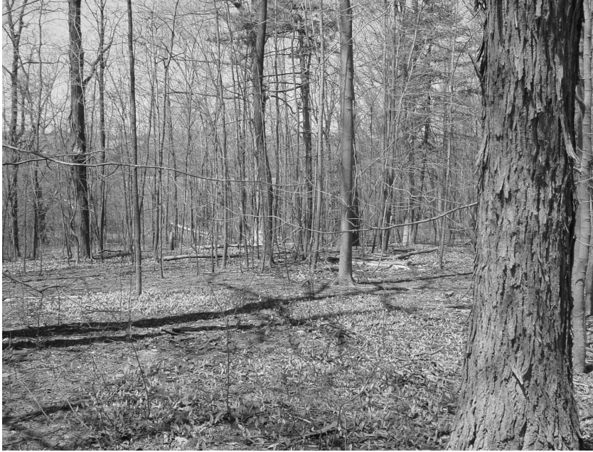
Hansen Nature Area: Photopoint 4, April 29, 2003

It is a typical photopoint day in May and I am heading to Hansen Nature Area, a ten-acre woods off of South Maple Road, to take the spring photos. With map in hand, my work is a little like a treasure hunt. I must find the exact spots in Hansen where photos have been