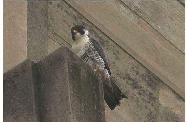
Peregrine on the Burton Bell Tower

*A group of turkeys is called a "rafter."