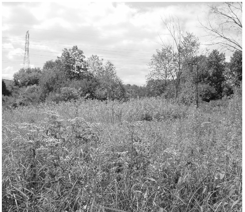
Foxfire West Nature Area: Photopoint 6, August 30, 2004

If you'd like to help Maggie with NAP's photo documentation, contact our office.