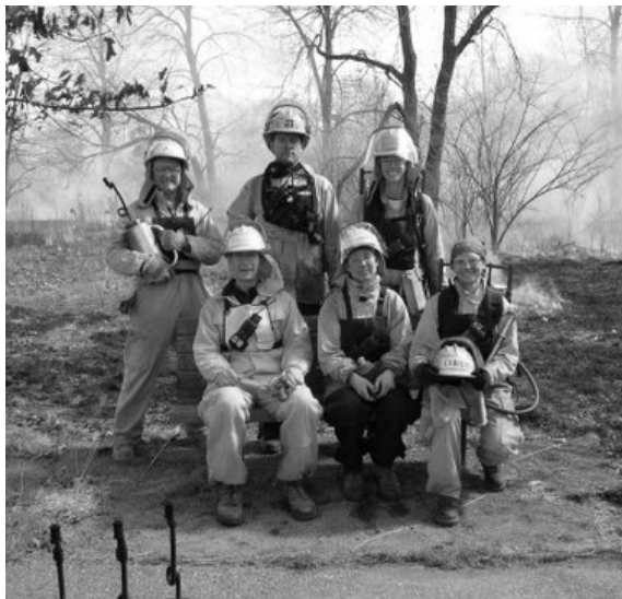
NAP staff and volunteers at Furstenberg

Lately we've heard quite a few people ask, "what's going on at Brown Park?" This Washtenaw County Drain Commissioner's construction project will improve water quality in Malletts Creek by creating a 15-acre wetland to filter out nutrients and sediment from storm water, and help control flooding. The park will be closed during the work, until August 2007. The wetland will be named Mary Beth Doyle Wetland Preserve, and the whole park will be renamed as Mary Beth Doyle Park, to honor the memory of the local environmental activist. The wetland is expected to improve wildlife habitat in the park by providing native wetland plants for food and cover, and increasing the size and connectivity of natural areas adjacent to Malletts Creek and Swift Run Creek. Please excuse the dust, and look for the finished product in 2007!