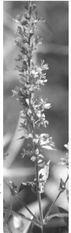
Lythrum salicaria, purple loosestrife

Invasive Plants of the Upper Midwest is available from University of Wisconsin Press: www.wisc.edu/wisconsinpress/books/3601.htm