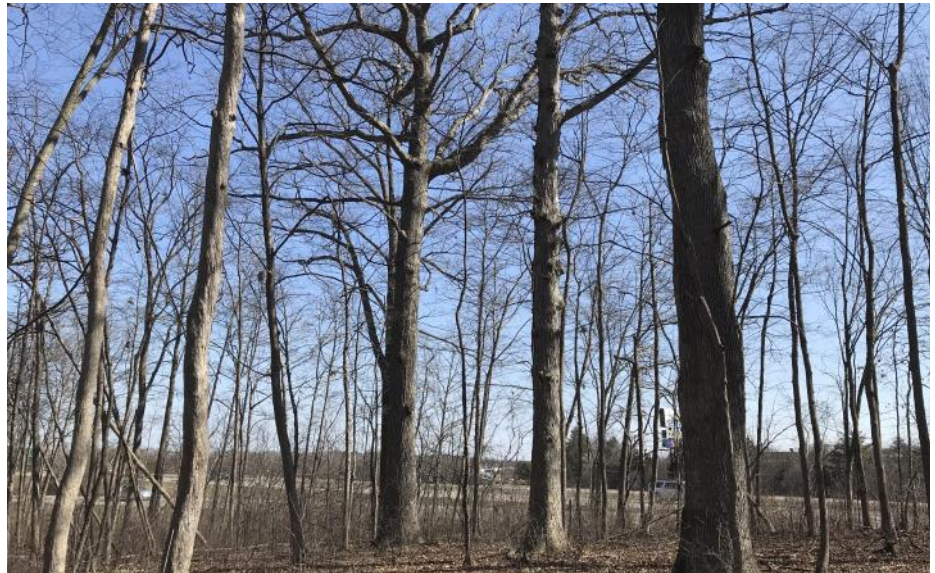
Sylvan Park is a peaceful oak-hickory forest next to busy US-23

A morning spent at Sylvan Park offers a view of two seemingly opposite worlds existing atop one another. Parents emerge from their homes in the Forestbrooke subdivision to whisk the kids off to school. Commuters cram onto the highway, just a minute too late to beat the morning rush. The bustle of commerce whirs to life at the Arborland shopping center. Real