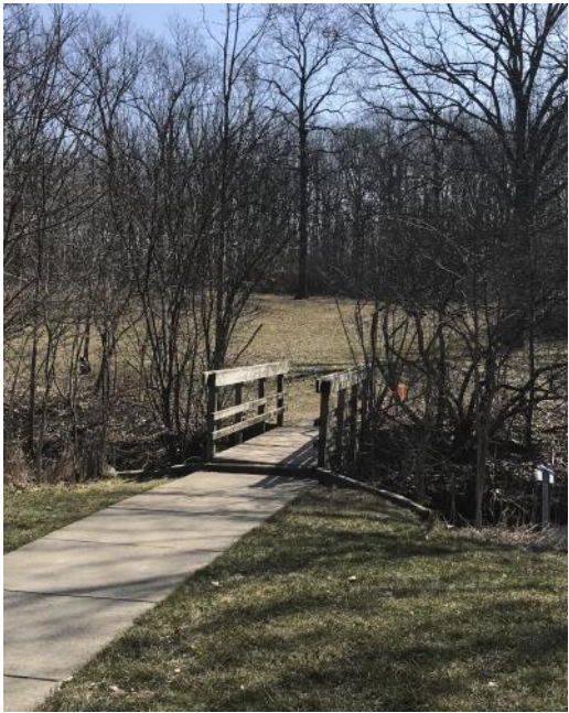
The bridge over Swift Run Creek

you're faced first with a tennis court, a play area with a swing set and jungle gym, and an open grassy area edging Swift Run Creek—nice, but nothing special. Then, just as you cross the small footbridge spanning Swift Run Creek, you have a feeling of déjà vu. A trickle of dimly recalled sensations cascades into moments vividly relived.