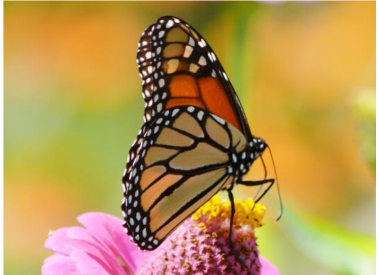
Monarch Butterfly

A new subcommittee of the Ann Arbor Environmental Commission, The Ann Arbor Pollinator Subcommittee, was established in 2017 with the aim of improving pollinator health. Member organizations/entities include: NAP, Leslie Science and Nature Center, National Wildlife Federation, Ann Arbor Bee City USA, Bee Safe Ann Arbor, Ann Arbor Farm and Garden Association, Ann Arbor Public Schools, Washtenaw County Water Resources Commission, University of Michigan Office of Campus Sustainability, and Washtenaw County Parks. The Pollinator Subcommittee meets monthly and is working to identify concrete actions that can be taken throughout the city, including engaging Ann Arbor residents to help. Even small steps can make a big difference.