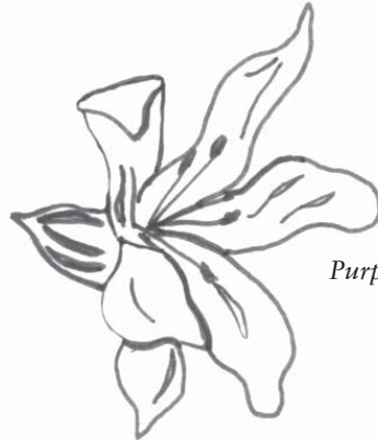
Purple loosestrife flower