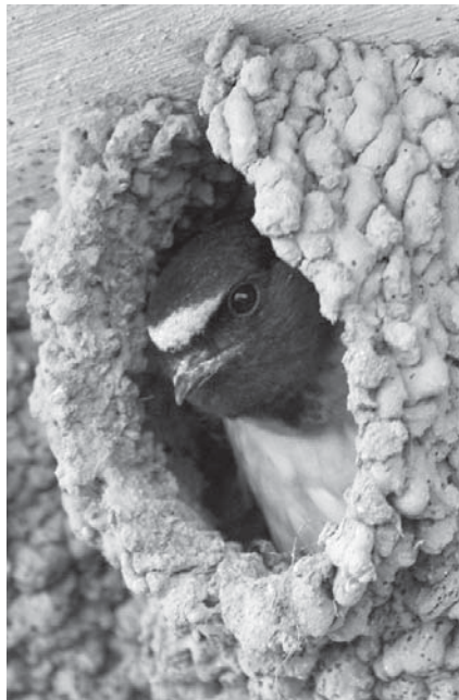
A Nesting Cliff Swallow in Gallup Park

The Stewardship Network's Annual Conference will be held on January 25 & 26 in East Lansing, MI. The Science, Practice & Art of Restoring Native Ecosystems will be a fun and information-filled couple of days linking wildlife enthusiasts, nature lovers, land managers, and researchers from throughout Michigan. See announcement on page 5. For more information and to register, visit www.stewardshipnetwork.org .