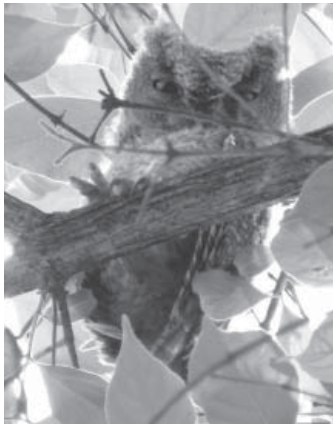
A baby Eastern Screech Owl

My birding with NAP began in April, surveying for three owl species and American Woodcock. On my first visit to Barton Nature Area, a well known site for woodcock, I was not surprised to find two male American Woodcock in the large open meadow near the center of the park. I also turned up a slew of Eastern Screech Owls in Black Pond Woods, Eberwhite Woods, and Dolph Nature Area. Leslie Science and Nature Center staff reported, and I verified, a family of Eastern Screech owls – a juvenile with parents – which confirms their breeding status in Black Pond Woods.