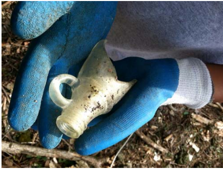
A piece of an antique bottle discovered at the archaeological dig.

Excitement is high for some sixth-graders at Scarlett Middle School who are getting a chance to be archaeologists and environmental stewards at the same time thanks to the discovery of an old farm dump deep in the Scarlett Mitchell