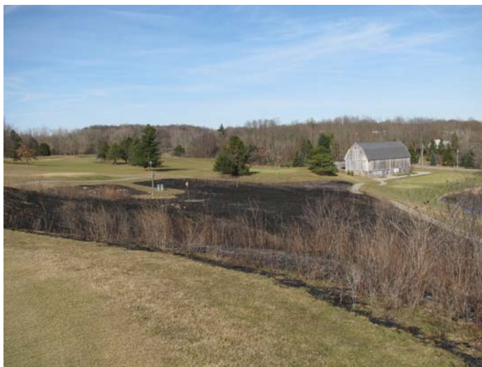
Leslie Park Golf Course following a controlled burn.

Leslie Science and Nature Center, and Black Pond Woods. Much of the landscape was transformed into orchards for apples, peaches, and cherries, range lands for Hereford cattle, and fragmented woods. The land rotated through these different land uses for over 50 years until the Leslie family sold and bequeathed the land to the City of Ann Arbor. The LPGC was developed in the areas surrounding Traver Creek that were once orchard and grazing lands. Surrounding much of the course are the remnant woodlands left mostly undisturbed and today managed by NAP.