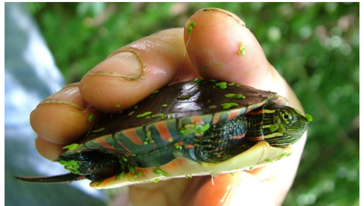
A painted turtle found by a NAP volunteer.