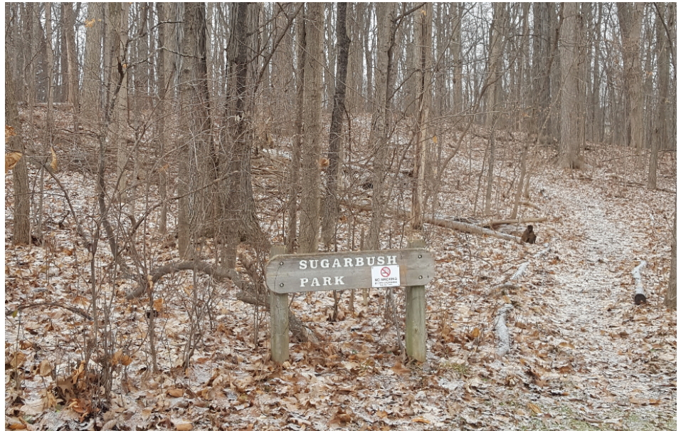
Sugarbush: The woods at the south end of the park is over 80 years old, and it's likely that the land there was never plowed.

Last November, NAP's prescribed burn crew was able to conduct a burn in Sugarbush for the first time. NAP