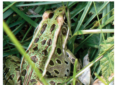
This species, the Northern Leopard Frog, is found in few locations in Ann Arbor, and is in decline across Michigan, so it's especially important to record when found.