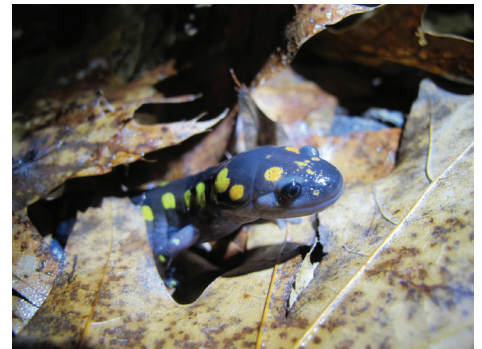
Spotted Salamanders like this one live in the woods and breed in the vernal pool in Sugarbush Park.

There are lots of opportunities for you to be a citizen scientist in our parks. We hope you'll get involved!