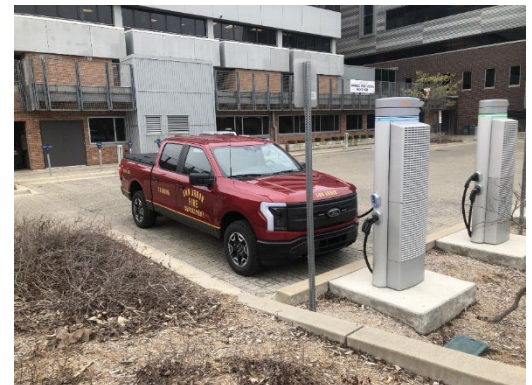
AFD Electric Truck charging at City Hall.

A2ZERO EQUITABLE • SUSTAINABLE • TRANSFORMATIVE