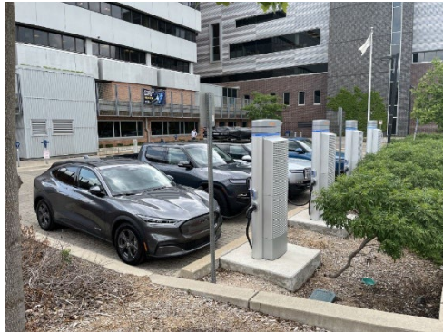
Privately owned EVs charging at City Hall.

Public Charging Infrastructure. The City has made large strides in recent years to provide reliable EV charging to the public. This has included the deployment of four fast chargers at City Hall which support charging for City fleet and are available to the public. We've also deployed 40 public dual port chargers in DDA garages (80 additional units). More recently, the City worked with partners to deploy the first three publicly available