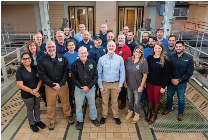
City of Ann Arbor Water Treatment Plant Staff

We are truly grateful for the dedicated and professional Water Treatment Plant staff who continue to tirelessly deliver safe and potable water to our customers.