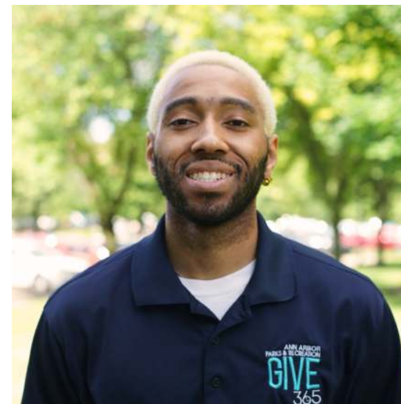
DOM Crew / Event Team