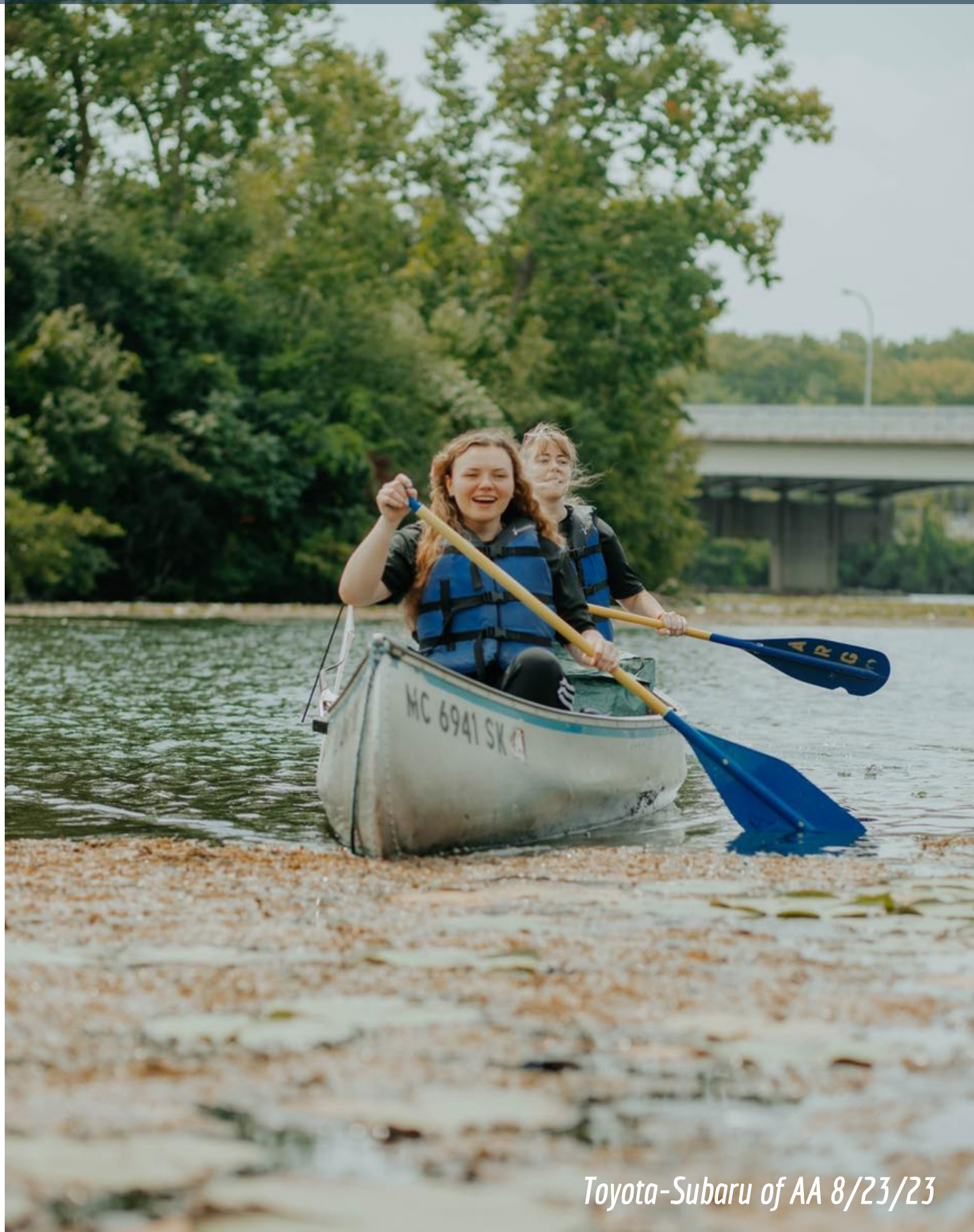
Toyota-Subaru of AA 8/23/23