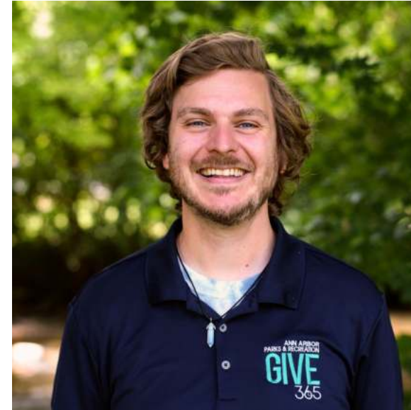
RYAN Marketing / River Cleans