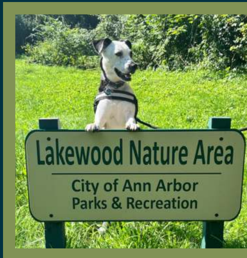
Elana (Pictured: Kodi)