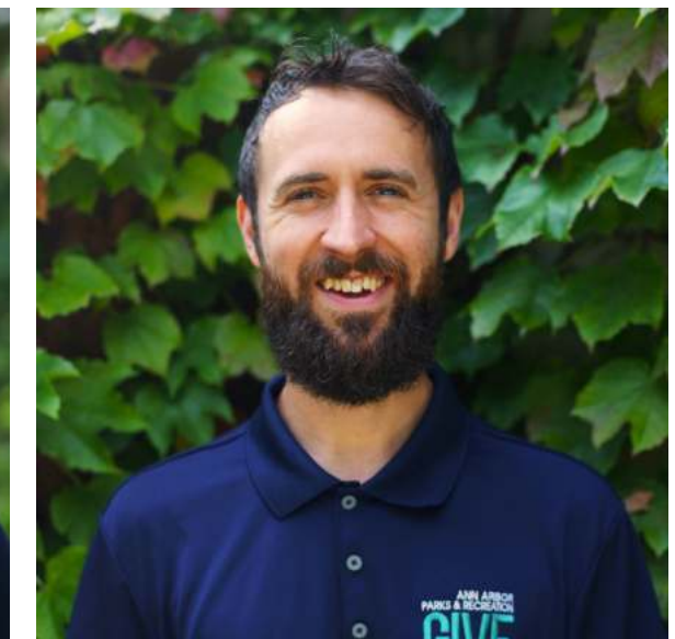
GARRET Bike Parks / Event Team