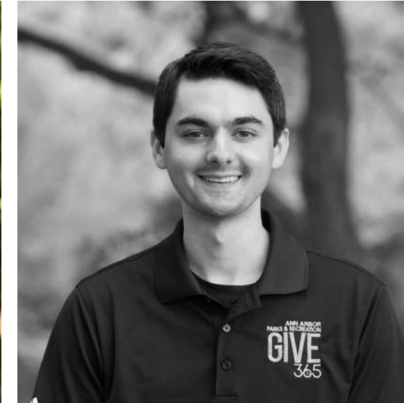
CONOR Outreach Coordinator Left in Sept 2023*