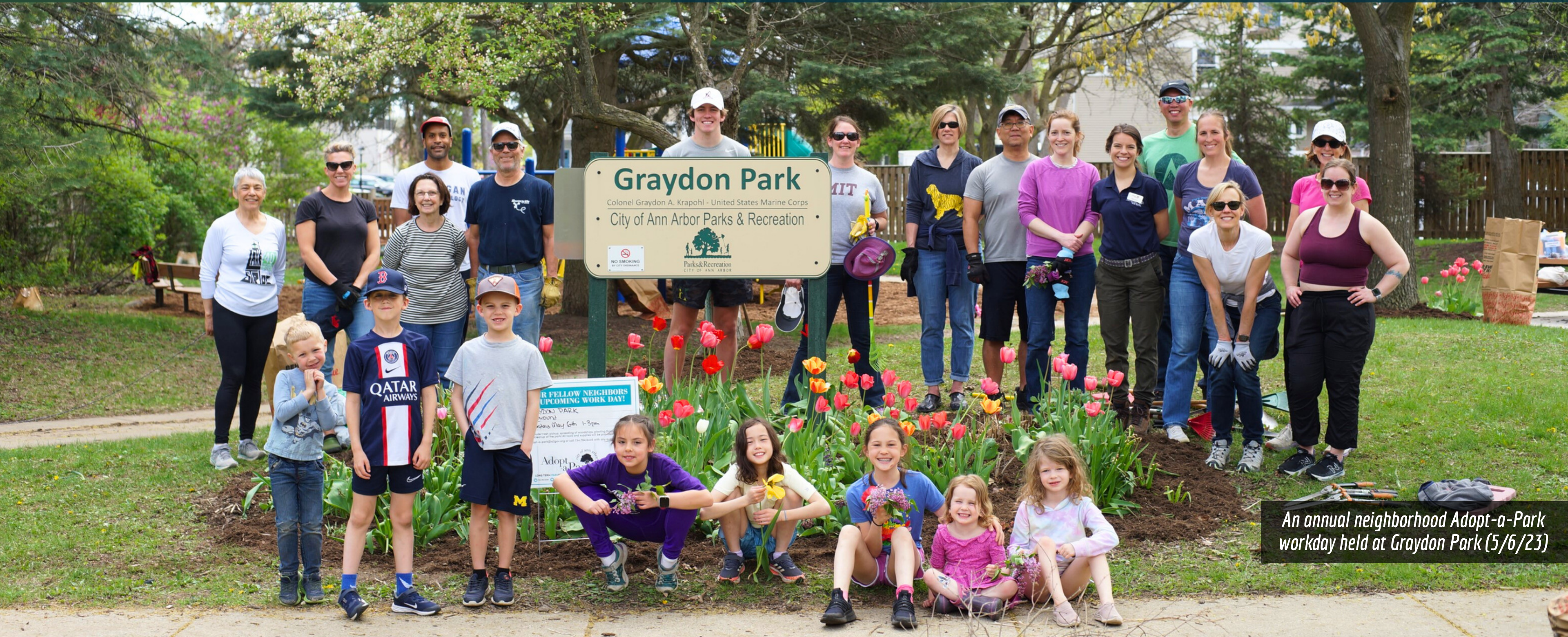
An annual neighborhood Adopt-a-Park workday held at Graydon Park (5/6/23)

The Adopt-a-Park program, which is part of GIVE 365, fosters long-term relationships with an individual park. Adopters and staff work together to develop expectations, create workplans, and schedule workdays. These adopters can be individual people or groups & organizations, including neighborhood groups, businesses, and more.