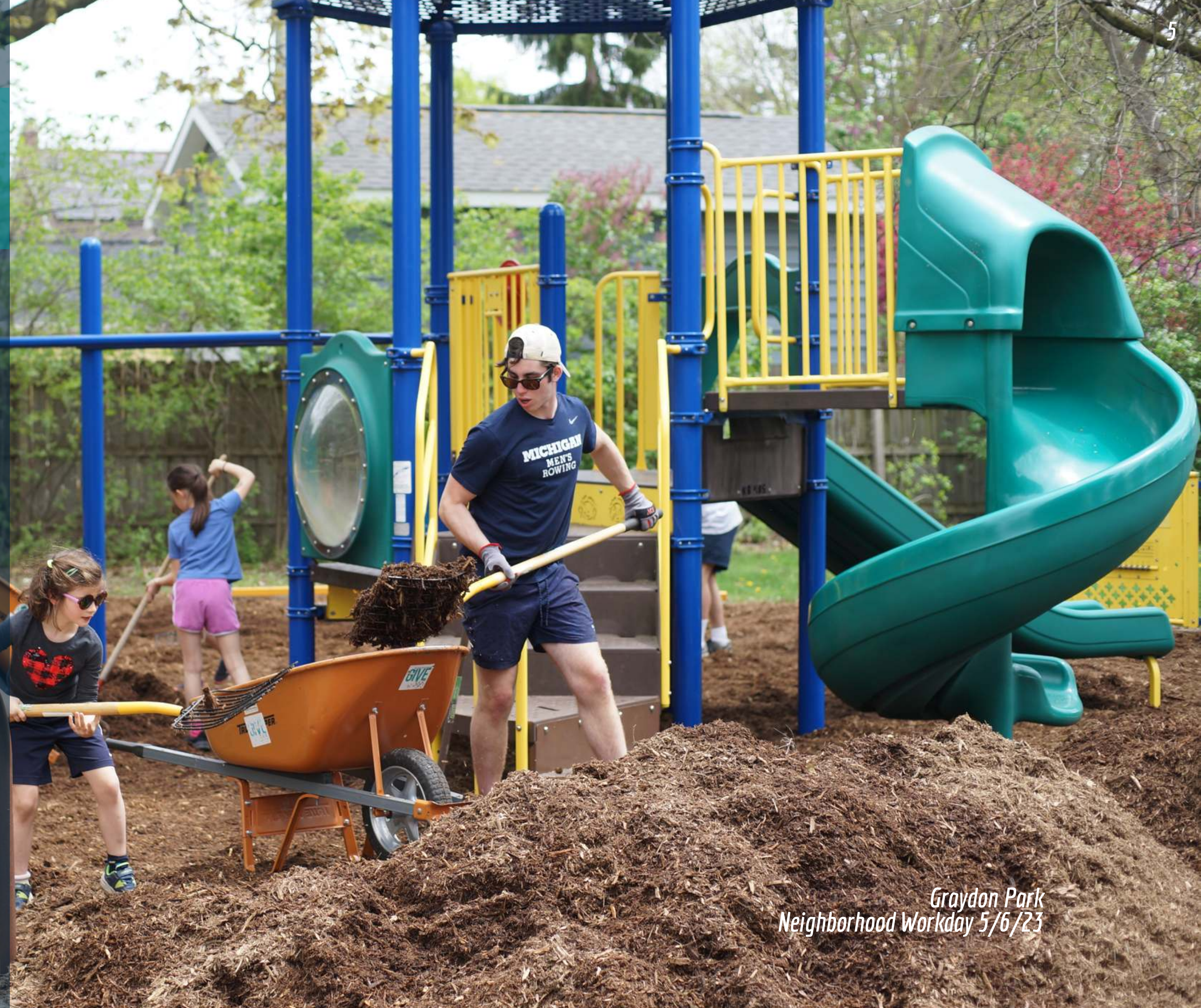
Graydon Park Neighborhood Workday 5/6/23