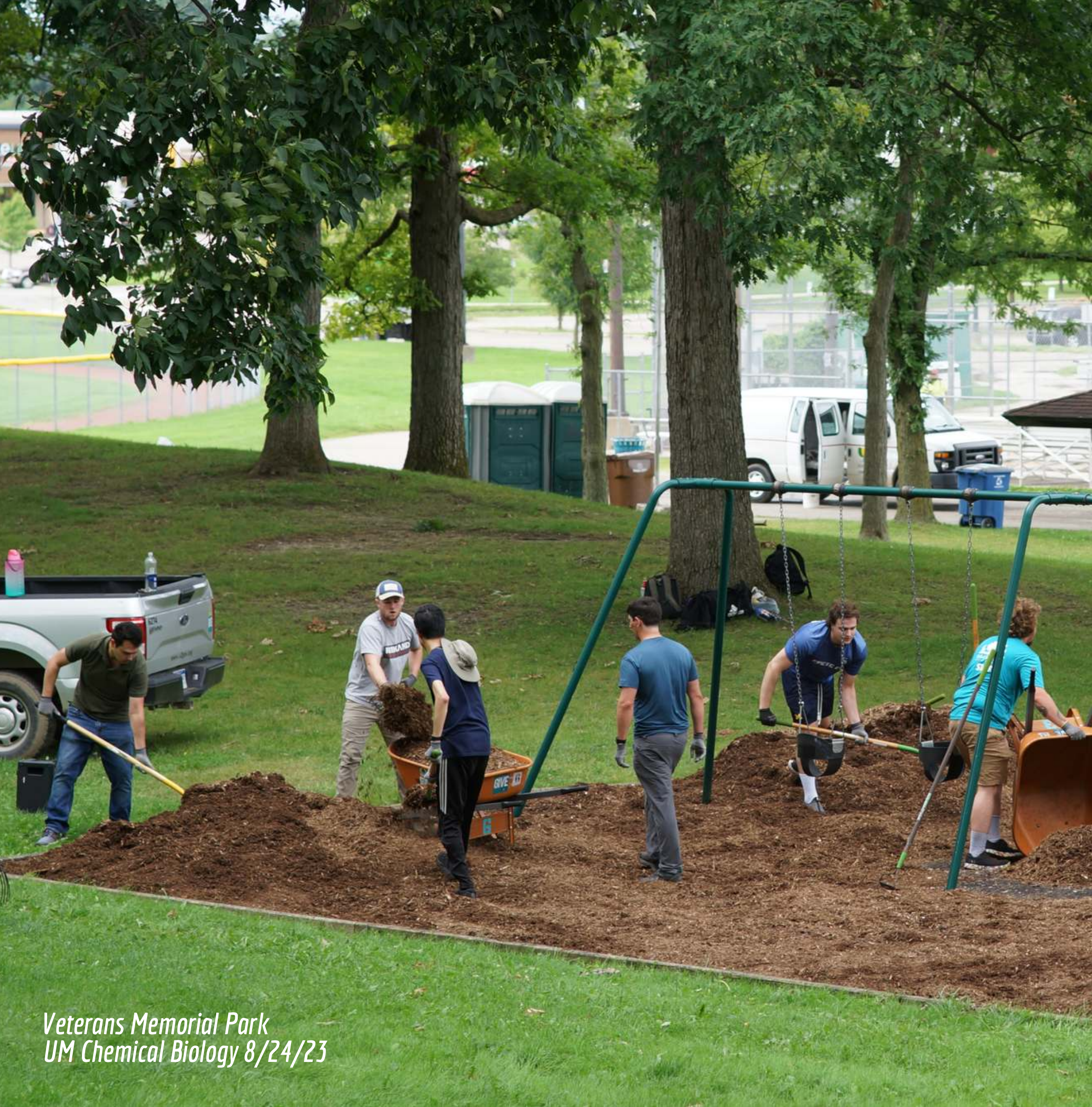
Veterans Memorial Park UM Chemical Biology 8/24/23