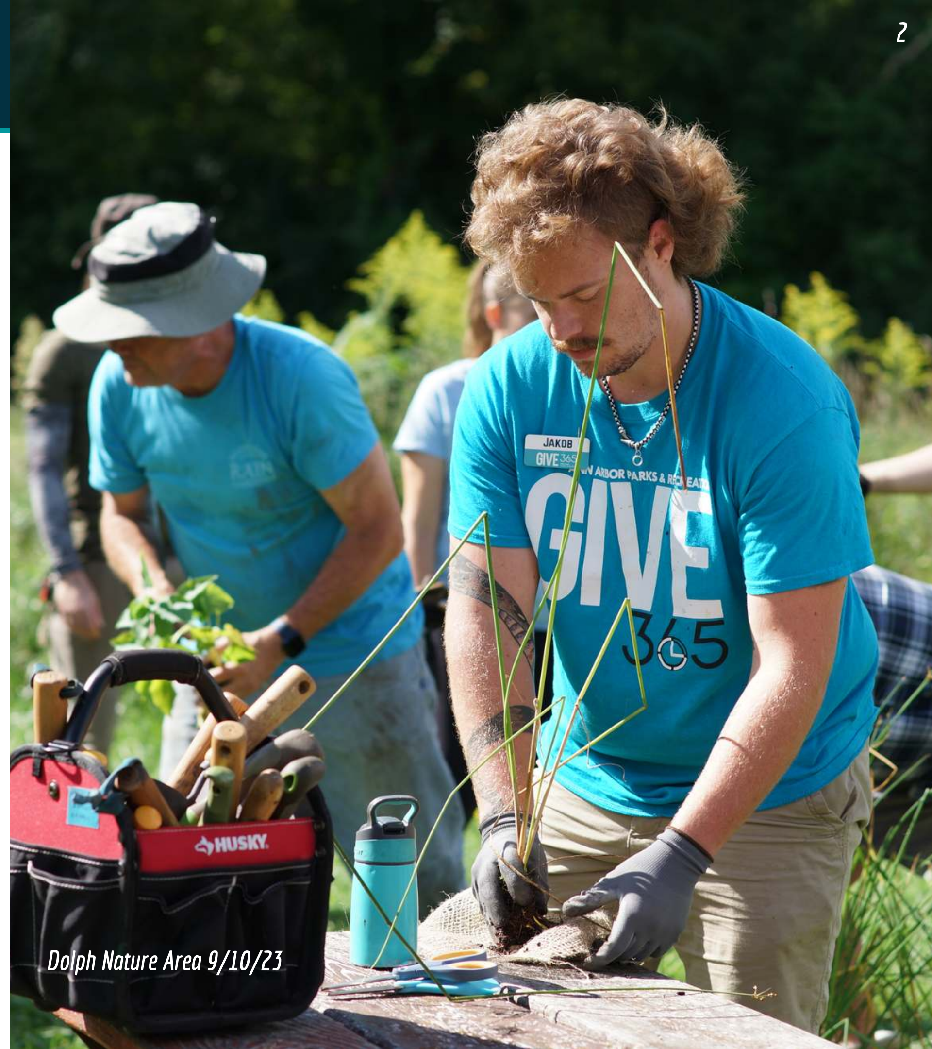
Dolph Nature Area 9/10/23