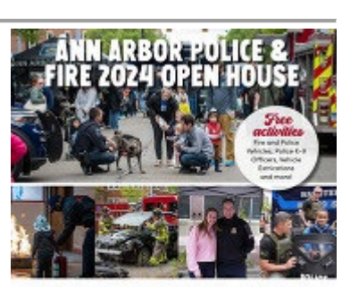
YOU'RE INVITED TO THIS FREE, FAMILY—FRIENDLY EVENT Saturday, May 16, 11 a.m.-2 p.m. Join us for the annual City of Ann Arbor Fire and Police seen house at Fire Station 1, 111 N, Fifth Ave.

Meet local first responders (including police K-9s!), watch demonstrations, "touch a truck" with fire and police vehicles onsite and more at the annual City of Ann Arbor Fire and Police Open House! Snacks will be available, too, while supplies last. The free event takes place along Fifth Avenue, in front of fire station No. 1, 11 a.m.–2 p.m. Saturday, May 18.