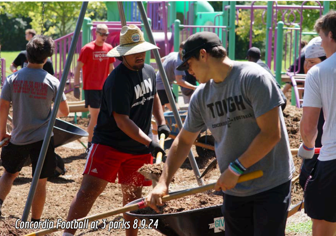
Concordia Football at 3 parks 8.9.24

September 1 is the first day of meteorological fall! The last month of summer was a busy one. Volunteers made a huge impact, highlighted by a massive invasive removal project at Burr Oak Park and the Concordia football team resurfacing 3 park playgrounds at once. There's still plenty of opportunities to help in the parks in autumn!