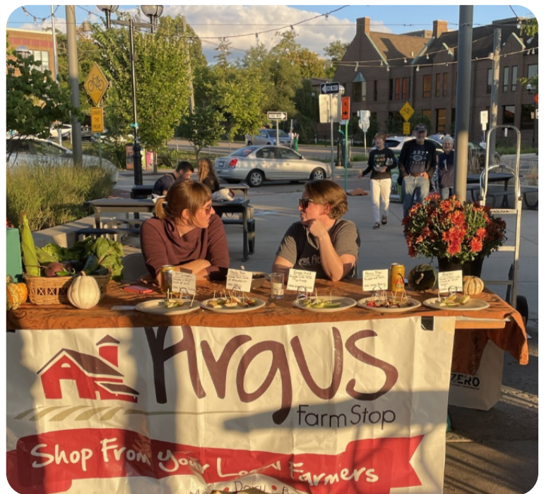
Produce tasting at the 2023 Ann Arbor Local Food Festival.

Supporting local food systems is not just about how we eat – its about how we live and thrive together. It’s about recognizing the value of community-based agriculture, honoring the work of local farmers, and investing in a future where resilience, sustainability, and prosperity go hand in hand. Ann Arbor already has many of the ingredients that make a strong local food system. As we confront the interconnected challenges of climate change and social justice, it’s important for our community to continue investing in and supporting the local food system to ensure a resilient, inclusive, and sustainable food system for generations to come.