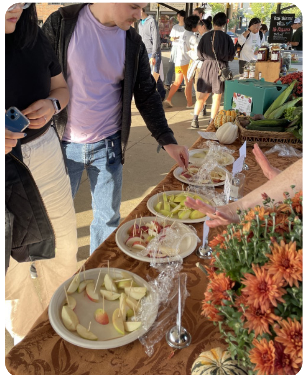
Event attendees at the 2023 Ann Arbor Local Food Festival taste different varieties of locally grown apples.

In addition to these benefits, local food systems also contribute to overall community and economic prosperity. By shopping locally, consumers can directly support farmers and producers, ensuring they receive a fairer share of the consumer dollar. This fosters local entrepreneurship and job creation and strengthens the community's economy. Furthermore, local food systems can preserve cultural heritage by maintaining traditional crops and agricultural or culinary knowledge. Most importantly, they build community resilience by fostering social connectivity, enabling communities to adapt, collaborate, and thrive through shared commitment and mutual support.