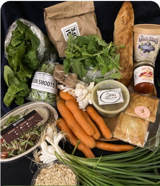
A recent weekly box from The Hungry Locavore, featuring a vibrant collection of local products from area farms & food producers.

To learn more about the Hungry Locavore and stay connected with their work, visit their website , their Facebook , and their Instagram .