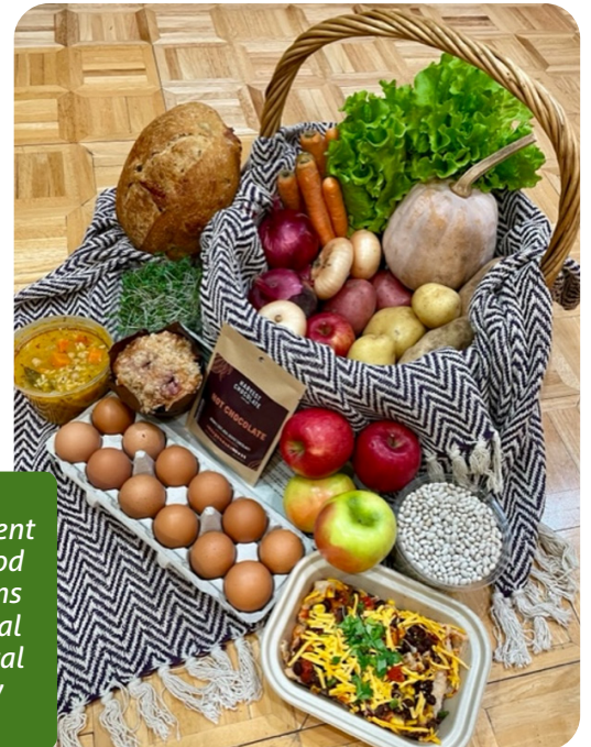
Each box from The Hungry Locavore contains an assortment of fresh, sustainably grown food products from a variety of farms & food businesses. The seasonal boxes are just one way this local food project builds community around local food.