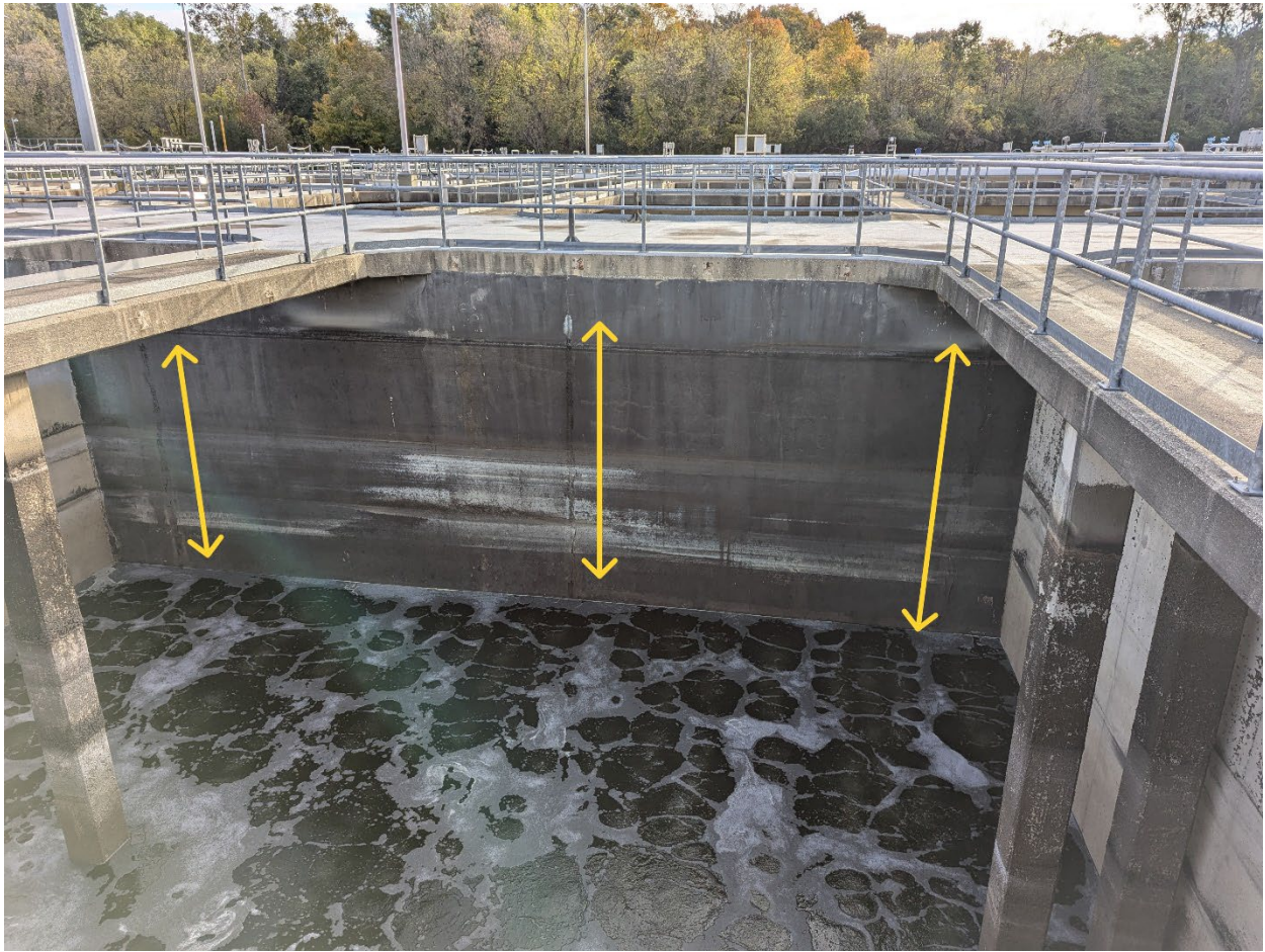
Outdoor section, Cracks 4-6. Previously repaired