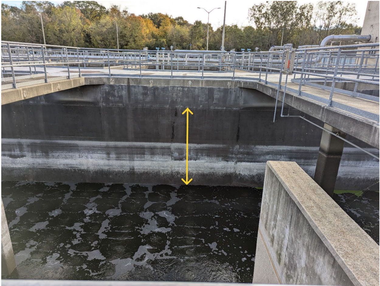
Outdoor section, Crack 9. Previously repaired

Opposite Galley Side of repaired crack Example 1-3.