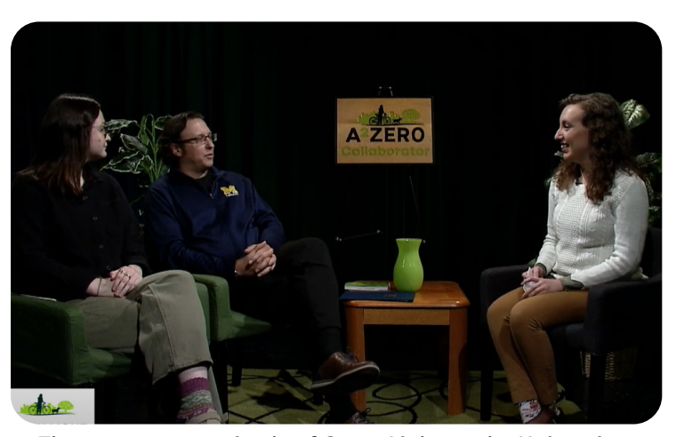
The most recent episode of Green Light on the University of Michigan Community Read.