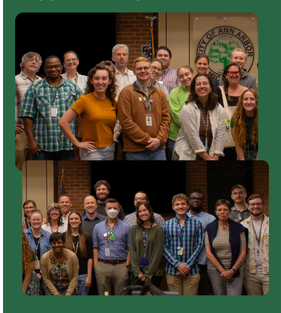
From the team (pictured here with the visiting delegation from Tuebingen, Germany in September)! Have a safe, comfortable, and warm holiday season and we'll see you in 2025.