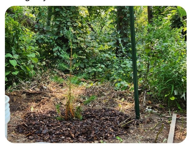
A tree planted at the Ann Arbor Bicentennial Tree Planting in September.