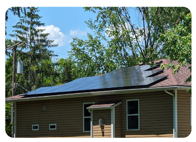
Solar panels installed through the Solarize Ann Arbor program this past year.