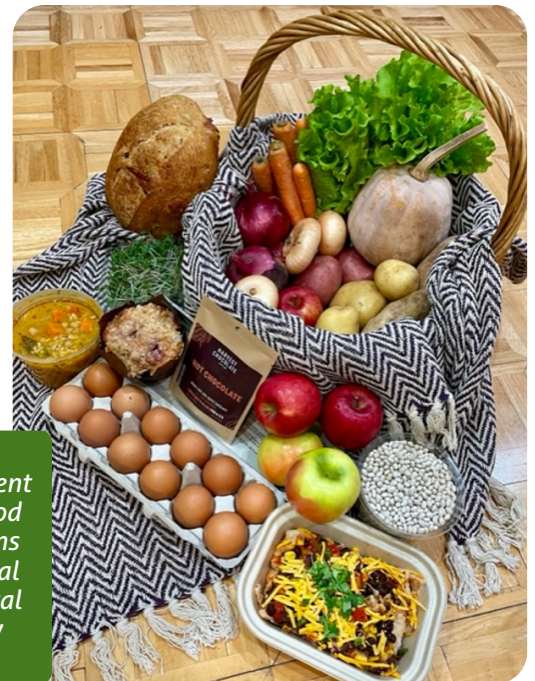
Each box from The Hungry Locavore contains an assortment of fresh, sustainably grown food products from a variety of farms & food businesses. The seasonal boxes are just one way this local food project builds community around local food.