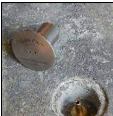
Figure 2: Sub-slab sampling point