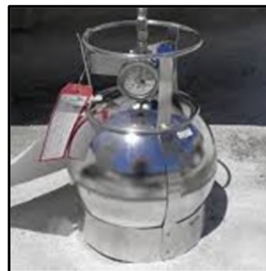
Figure 3: Indoor air sampling cannister