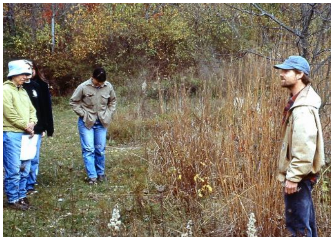
Training seed collection volunteers, 1998

Extension for most of the last 20 years. I work with natural resource volunteers, just like I did at NAP, and I continue to be inspired by the contributions of enthusiastic community members. In the last 5 years, I've been working on a project called Nature Groupie, an effort launched with help from The Stewardship Network in Michigan (so NAP connections are still at work!). We connect volunteers to nature-based stewardship and citizen science projects across New England. I have great memories of NAP: amazing and committed volunteers (the best!), Dave leading the staff in outdoor card games at lunch, worm composting, filling in with the burn crew, watching my first woodcock sky dance at Barton Nature Area and wading through a wet meadow somewhere along the Huron River with Joe Pye Weed way over my head.