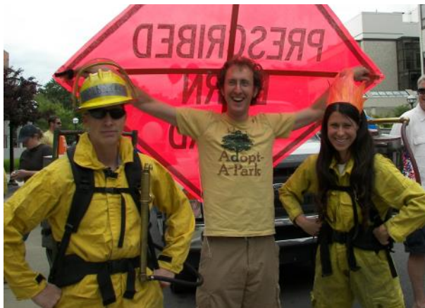
Fourth of July Parade, 2009