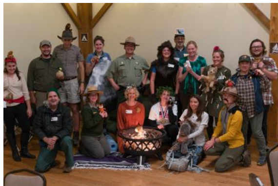
Staff in costumes at the potluck, 2017

Dan Engel (2015-16): I work as a contract biologist for the USGS - Great Lakes Science Center. My work has focused on Phragmites control efforts. I have many fond memories of working at NAP! My favorites all involve fire or some remote corner of a natural area away from the hustle and bustle of the city. The field skills that I acquired have been invaluable in my current job, and I am very grateful for everything I learned from my NAP mentors. An unexpected lesson I learned was the value of volunteers to a habitat restoration program - without public support and active involvement, restoration projects are not able to achieve their full potential.