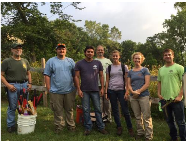
Setting up for a workday, 2015

This has been invaluable as one of the only state legislators with an environmental science professional background.