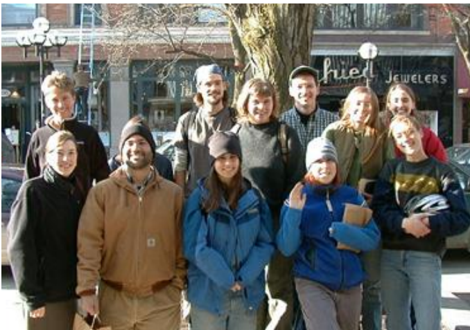
NAP Staff in 2001