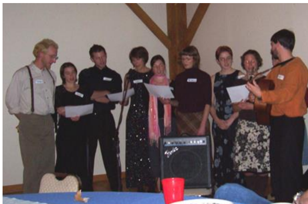
Staff singing at the potluck, 2006