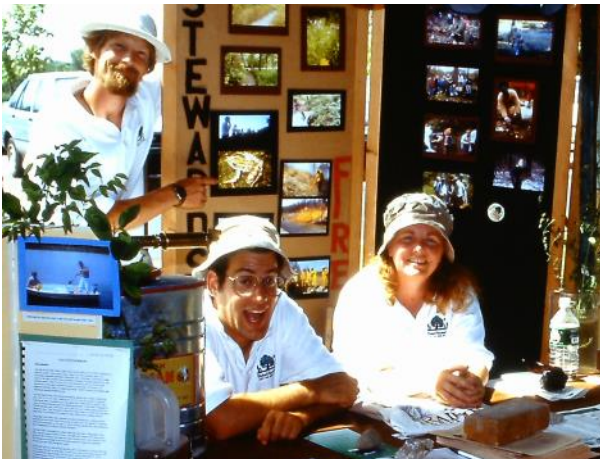
Huron River Day, 1996

I conducted rare plant surveys, and from there to UM Herbarium, where I've enjoyed working with the Michigan Flora Project. NAP gave me the opportunity to gain some local field experience, but more importantly, I learned about the importance of having places where people can connect with nature. I retired this summer from UM and am very much looking forward to sharing more time in nature with my grandchildren.