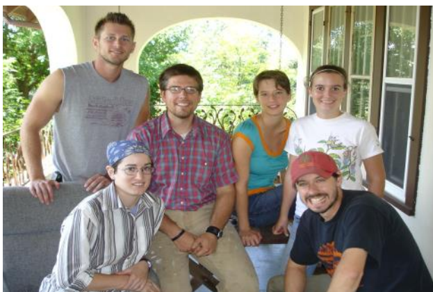
NAP Crew in 2007

to combat invasive species and restore high quality ecosystems, and coordinating independent monitoring/ surveying projects. I learned so much about ecological restoration and working with volunteers in my years at NAP that have helped me grow and have so many good memories from working at NAP. Highlights include time prescribed burning, pulling garlic mustard in the snow, working with fellow crewmembers, Park Stewards and staff.