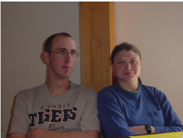
Outreach Coordinators in 2004