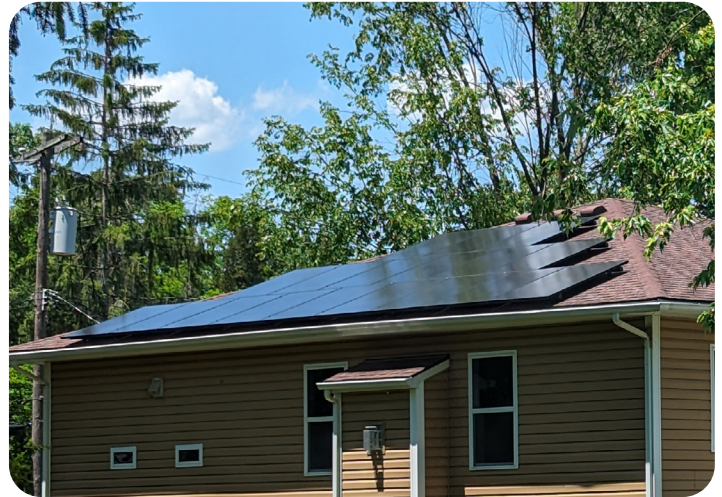
Solar panels installed through the Solarize Ann Arbor program this past year.