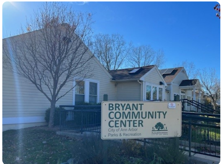
The Bryant Community Center, where geothermal drilling began recently.