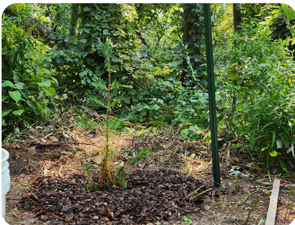
A tree planted at the Ann Arbor Bicentennial Tree Planting in September.