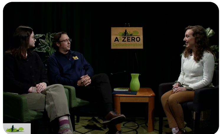
The most recent episode of Green Light on the University of Michigan Community Read.