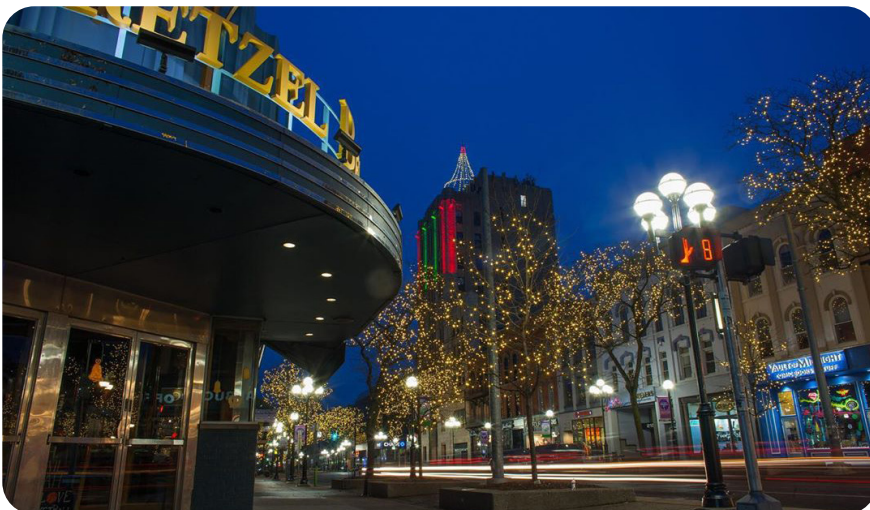
Main Street Ann Arbor with the winter lighting on display.