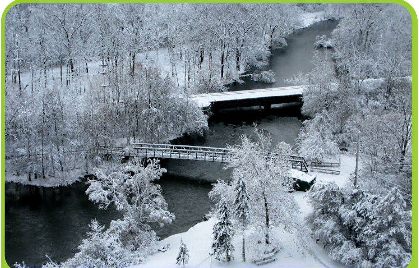
Bandemer Park in the winter.

From the team (pictured here with the visiting delegation from Tuebingen, Germany in September)! Have a safe, comfortable, and warm holiday season and we'll see you in 2025.