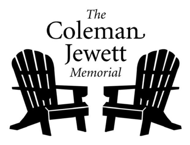
A Project of the Ann Arbor Public Art Commission

See Appendix F: Donor Letter for more information about the memorial project and this effort. Below is the fundraising campaign's logo: