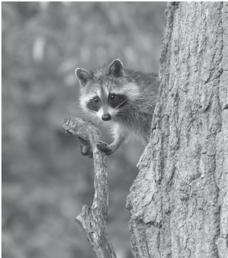
Stapp Nature Area is home to many kinds of wildlife including this curious young raccoon.

Photography is a great excuse to get outdoors. Just as valuable as the photographs of beautiful animals are the memories associated with them, and the intimate knowledge you gain from visiting your local nature area.