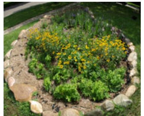
A rain garden in Ann Arbor

As part of the planned improvements for Miller Avenue, the city will be installing rain gardens in the public right-of-way along Miller Avenue, as well as in Miller Nature Area, and a small section of Garden Homes