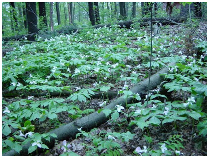
Trillium and Mayapple in bloom at Bird Hills Nature Area

Far off in Atlanta, the crowds were just beginning to gather at the Georgia Dome in anticipation of Super Bowl XXVIII. The encounter between the Dallas Cowboys and Buffalo Bills promised to be an epic showdown. Yet, back in Ann Arbor on that chilly afternoon in January 1994, a dozen fearless volunteers stood ready to roll up their sleeves and build a more accessible park for the whole community. Less than a year before, the citizens of Ann Arbor made history by voting for funding to begin a comprehensive city-wide ecological restoration program, and thus Natural Area Preservation was born. On this Super Bowl Sunday, 1994, the Ann Arbor community was engaging in the process of protecting and restoring one of our city's most interesting and valuable assets: Bird Hills Nature Area.