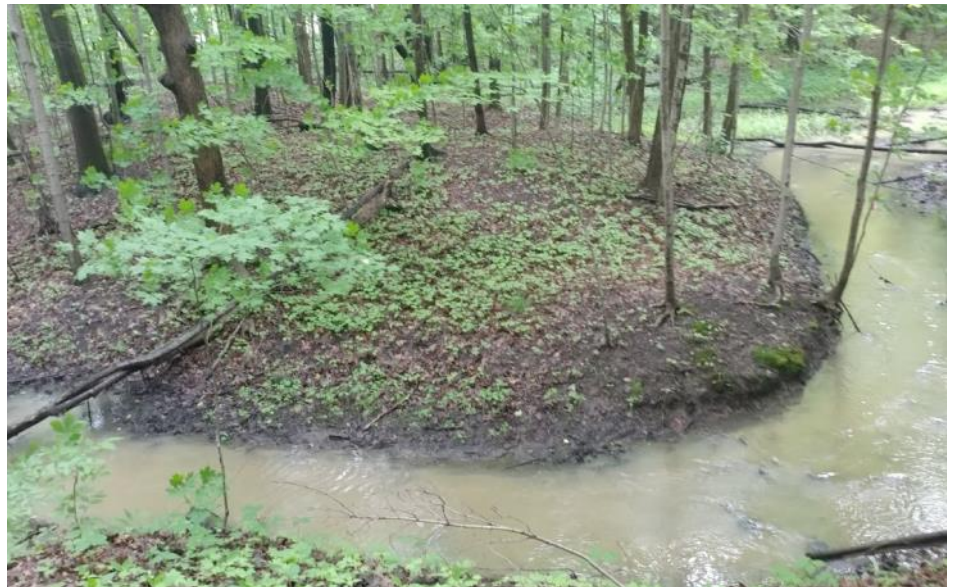
The creek flowing through the buttonbush woods, muddy, during the rainy spring

This nature area officially became a park in March of this year, but it is not yet officially named. The proposed name is "Buttonbush" after the beautiful buttonbush swamp in the eastern portion of the park. Although it is commonly