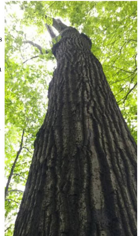
A towering oak tree in this new nature area

Join us for a workday at this new nature area on October 19. See the calendar on pages 4-5 for more details.