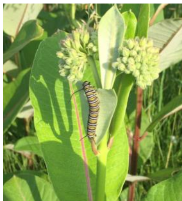
A monarch caterpillar on milkweed at the golf course

At NAP, we are supporting pollinator populations by working to restore and enhance pollinator habitat throughout our parks. Last fall, NAP was awarded a grant from the National Wildlife Federation to purchase native seed that would increase the amount and diversity of plants on which monarchs and other pollinators depend in our prairie, wetland, and savanna habitats. Over the winter and spring, the NAP crew spread seeds over 25 acres in five parks, so that the new plants, such as asters, goldenrods, coneflowers, and milkweeds will add additional support for pollinator species and help to grow their populations. We will continue to manage these habitats for invasive species and other threats, in order to give our pollinators and their plant hosts the best chance for survival.