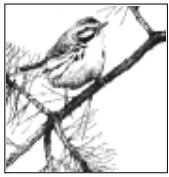
Prairie Warbler from Atlas of Breeding Birds of Michigan

A fairly detailed update of this year's breeding bird, butterfly, frog and toad, and plant survey appeared in the Autumn edition of the newsletter, so you'll find only brief final summaries here. More detailed summaries will be mailed to survey volunteers in the coming months.