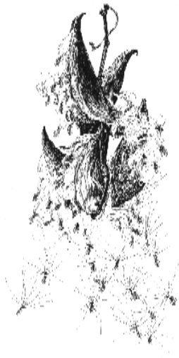
milkweed seeds from Faith in a Seed