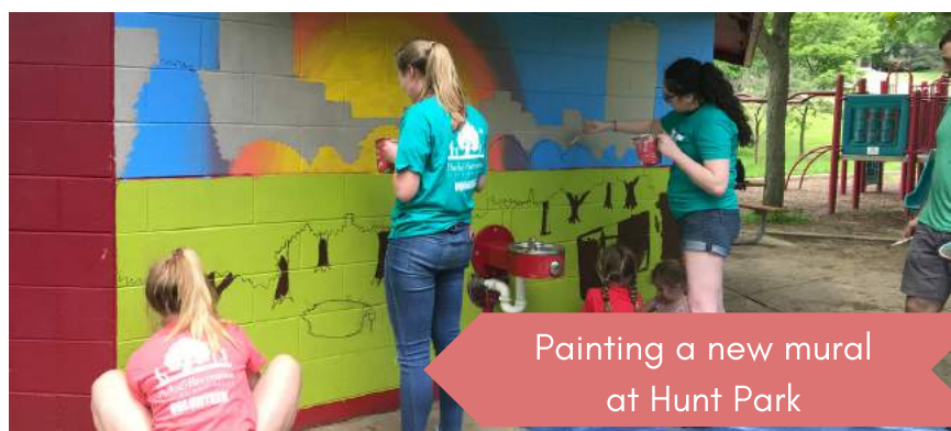
Painting a new mural at Hunt Park