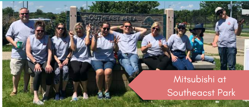
Mitsubishi at Southeast Park