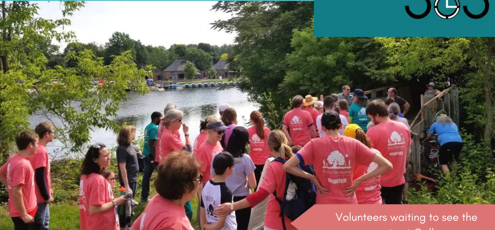
Volunteers waiting to see the goats at Gallup