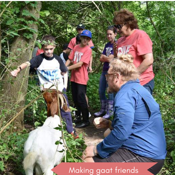
Making goat friends