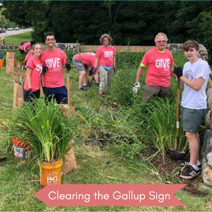
Clearing the Gallup Sign

"While goats are beautifying our park, you can too!"