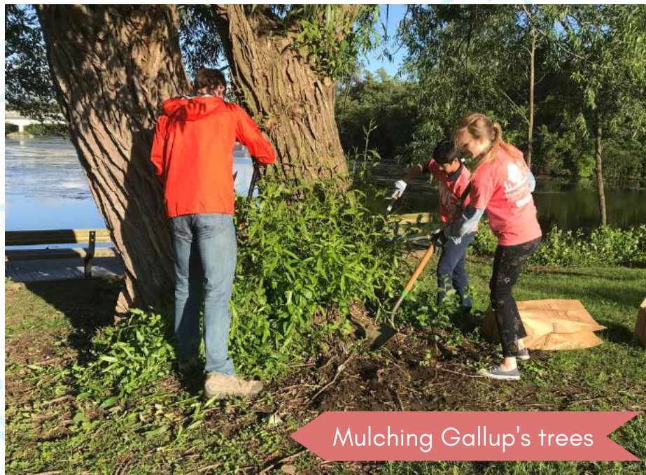
Mulching Gallup's trees

For an update of our goatscaping pilot program, to see before and after pictures, and to peruse even more scenes from the Talk and Walks, visit a2gov.org/goats-at-gallup .