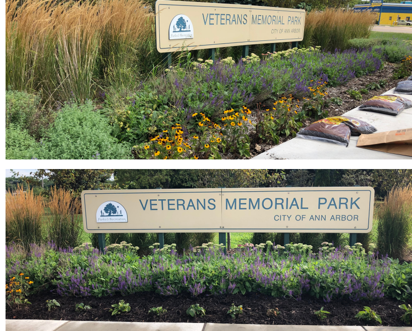
Love-A-Park day at Vertrans Memorial Park