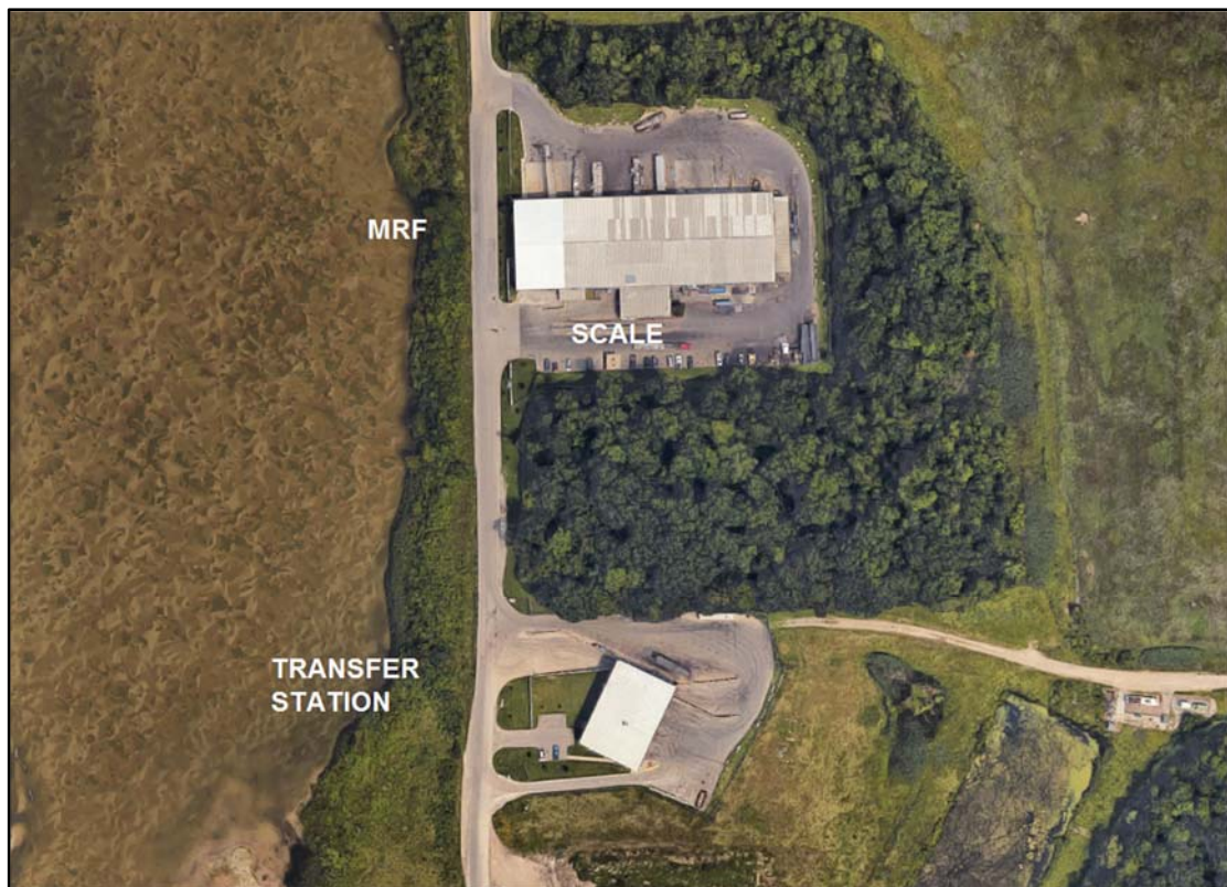
FIGURE 1. AERIAL VIEW OF TRANSFER STATION

The TS facility is currently operated by a private contractor under a short-term agreement. The City also contracts for disposal of the waste delivered from the TS and other City facilities under a separate disposal agreement, which expires on June 30, 2017. The intent of this RFP is to combine transfer station operations, transport and disposal services commencing July 1, 2017 under a single contract. In addition, the City desires to procure transport and disposal services for dewatered centrifuge cake and other materials from the City's Wastewater Treatment Plant (WWTP), and disposal services for street sweepings and vector/soil materials. The MRF is not a part of this RFP.