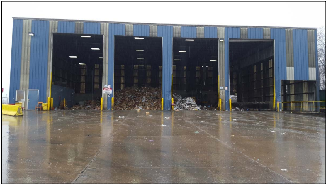
FIGURE 2. VIEW OF TRANSFER STATION BAYS

The TS building is approximately 115 feet wide by 80 feet deep, and provides four unloading bays (see Figure 2). The TS has a single, drive-through bay for semi-truck transfer vehicles. An approximately 4-foot high parapet wall separates the drive-through bay from the tipping floor.