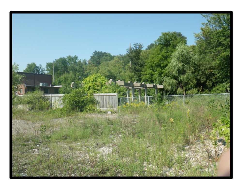
Looking west at the former Standard Oil Company property