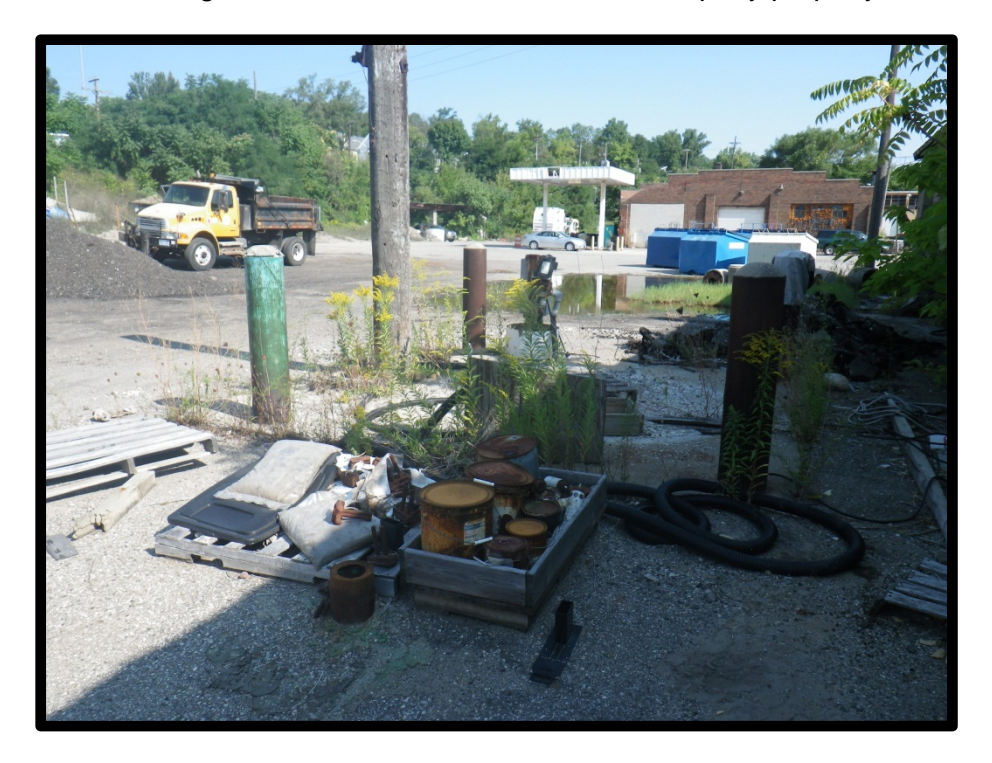
Miscellaneous paint cans and spray cans. Location of former chloride AST