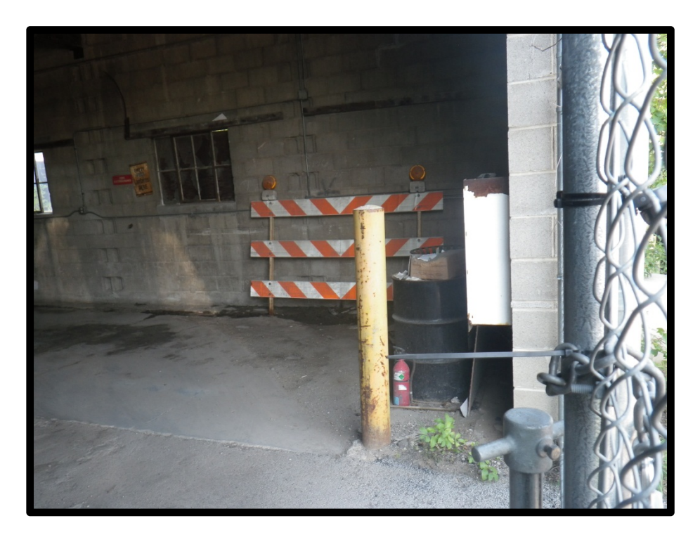
55-gallon drum located inside the garbage barn. A label was not visible.