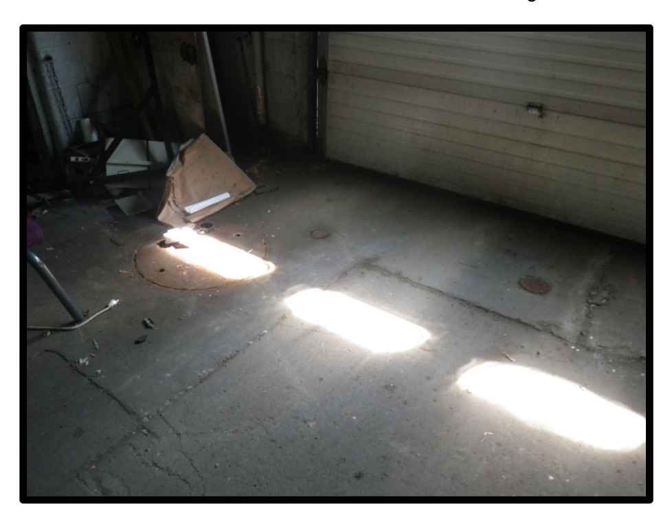
Sump/skimmer for oil UST inside the maintenance garage