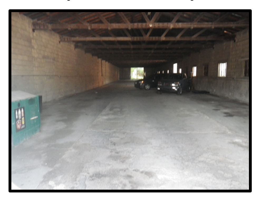
Looking south inside the garbage barn