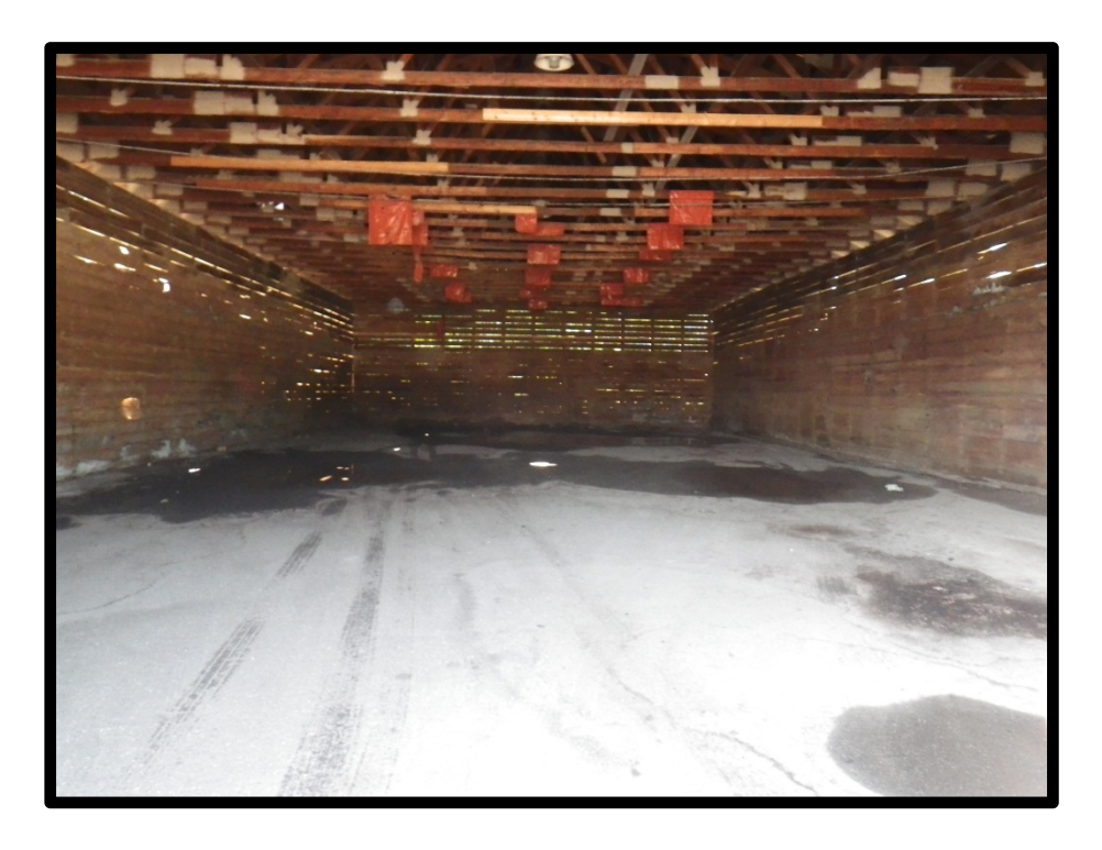
Looking south inside the wooden salt storage barn