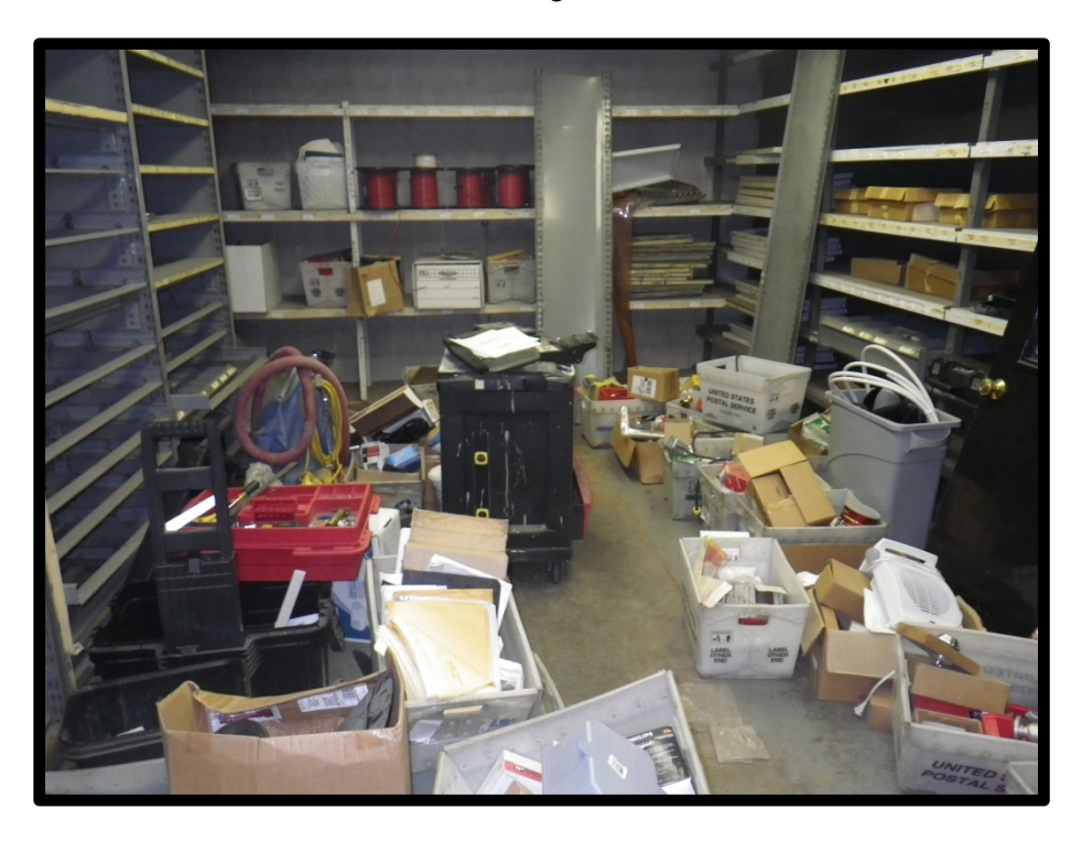
Former chemical storage room inside the maintenance building