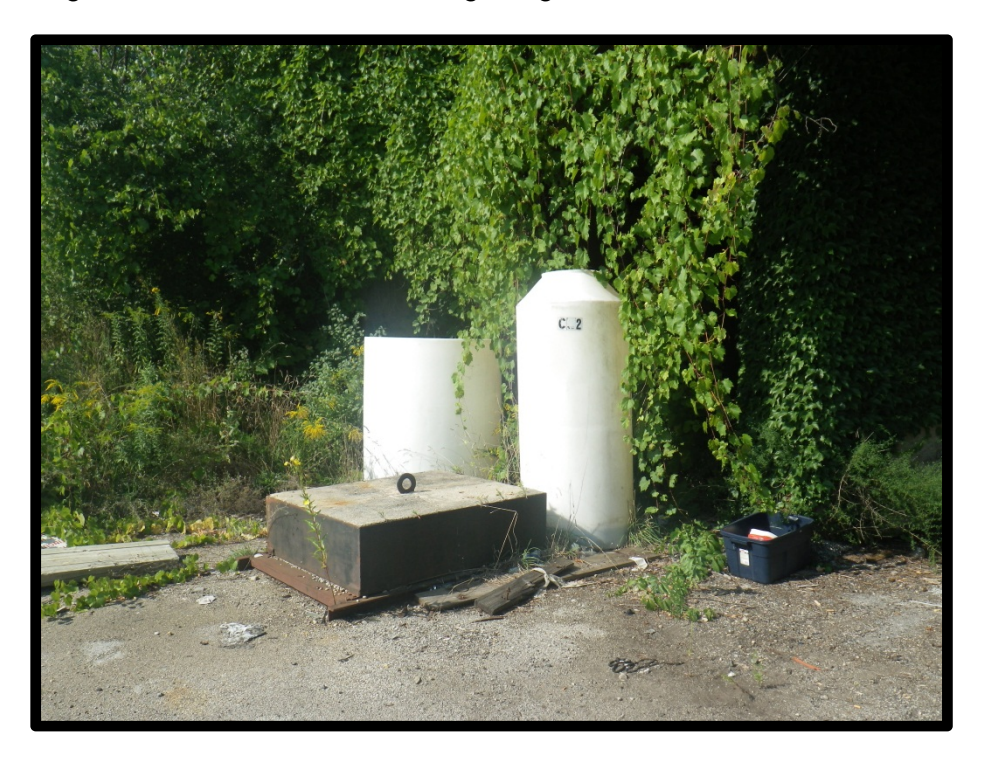
Empty ASTs located along the western side of the property.