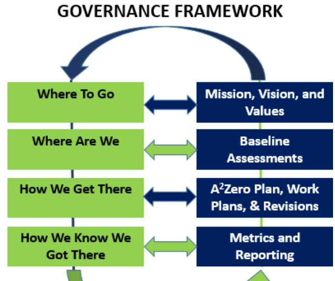
Figure 1: Governance Framework that notes the inputs that help answer where we want to go, where we are, how we propose getting to our goal, and how we'll know we've achieved our goal.

Guiding the process outlined below is a Governance Framework (Figure 1). The framework outlines what inputs tell us where we are going, where we are, how we propose getting from where we are to where we want to go, and how we will know we have achieved our goal. This governance document touches on each of these areas but is most prominently grounded in the third section, “How We Get There,” and especially the elements related to the A 2 Zero Plan and revisions / updates. This document also discusses how we gauge performance in regards to meeting our goal through indicators and metrics tracking and reporting.