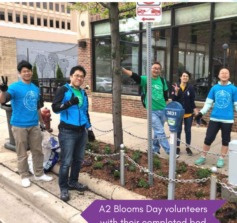
A2 Blooms Day volunteers with their completed bed

May marks many of our annual events, including A2 Blooms Day and Huron River Day. Thanks to all that came out, braved the rains, planted over 2,000 flowers, and made these events a success!