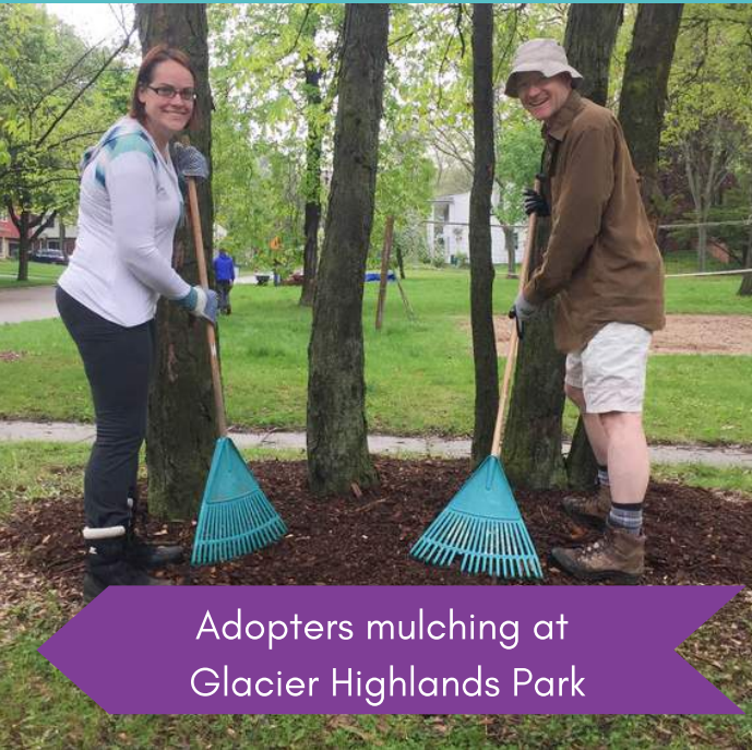
Adopters mulching at Glacier Highlands Park

Adopt-a-Park has had a great kick-off to the season with six neighborhood park clean ups on Saturday, May 18th at Allmendinger Park, Burr Oak Park, Glacier Highlands Park, Greenbrier Park, Winewood Thaler Park, and Wurster Park. These park adopters and their neighbors came together to beautify their park and get it in tip-top shape for the summer! Projects included weeding, planting flowers, mulching trees, removing invasive vegetation, and more!