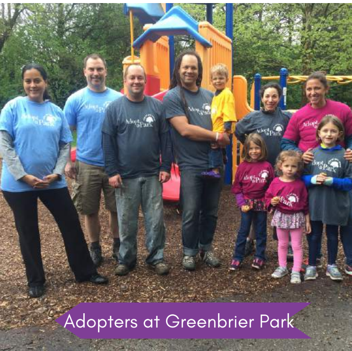
Adopters at Greenbrier Park

Thank you so much to these amazing neighbors for organizing their park clean-ups and providing so much care.