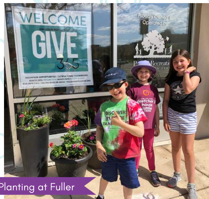
Planting at Fuller