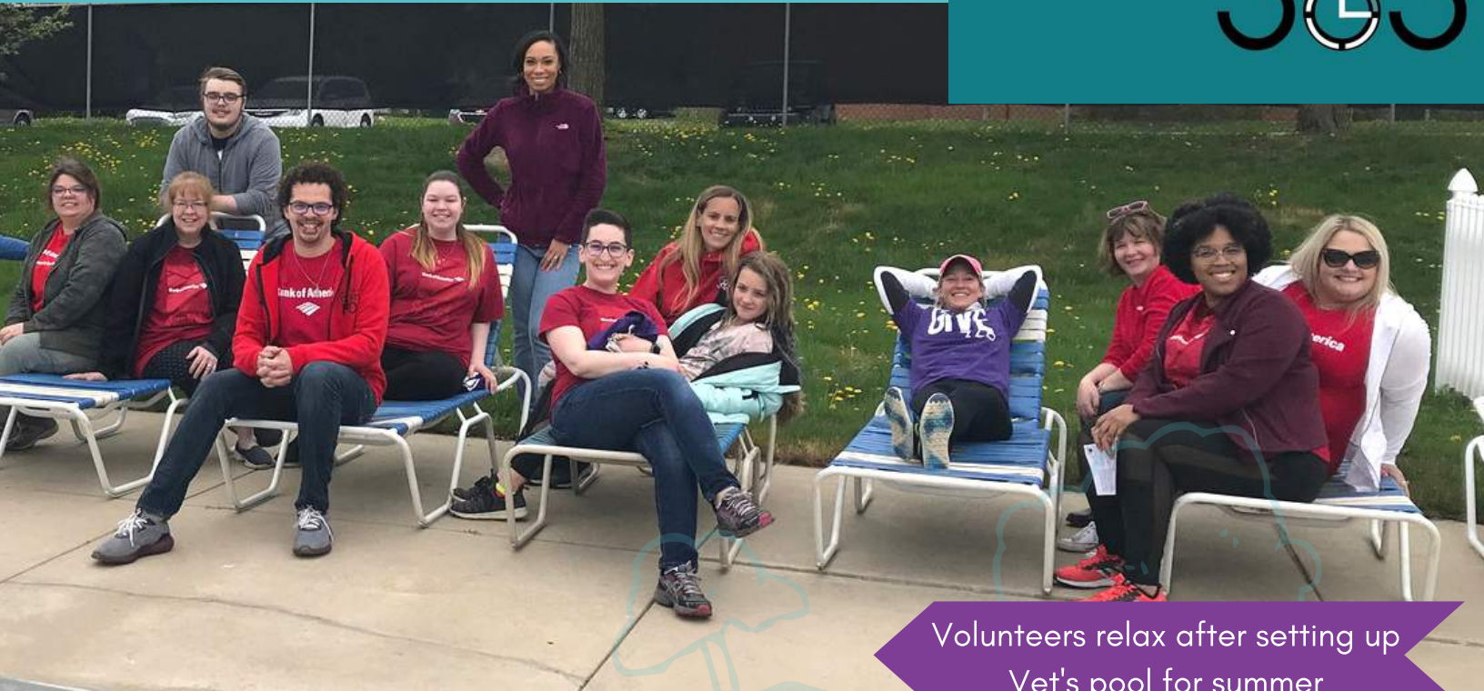
Volunteers relax after setting up Vet's pool for summer