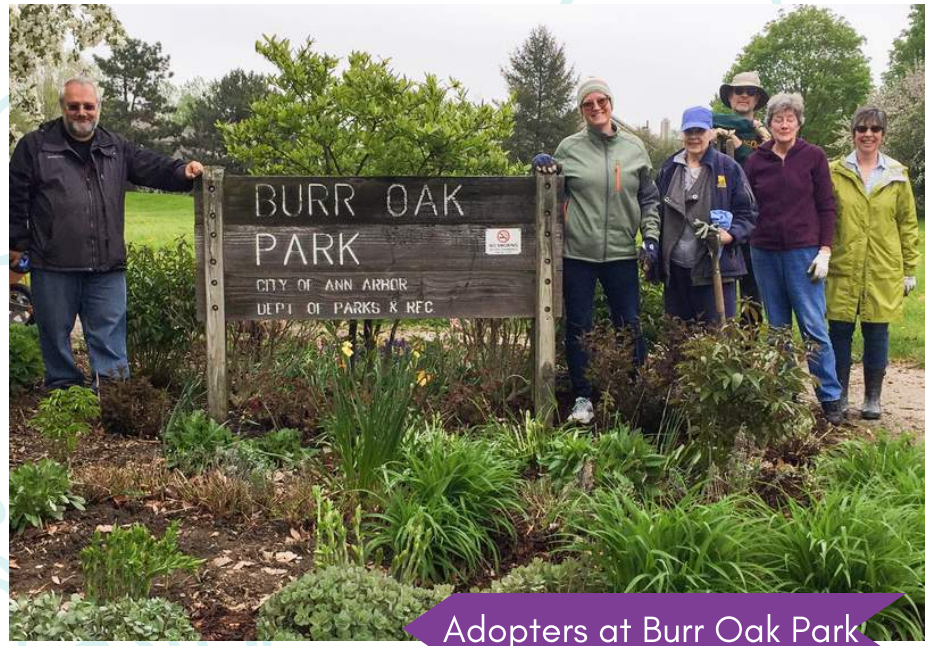
Adopters at Burr Oak Park

We have also had several awesome workdays with school groups and businesses at their adopted parks this spring. And we can't forget about our wonderful individual adopters who put so many hours and such dedicated care gardening and tending to their park. If you would like to be involved in giving your local park some extra TLC or inspiring your neighborhood to get involved together, let us know!