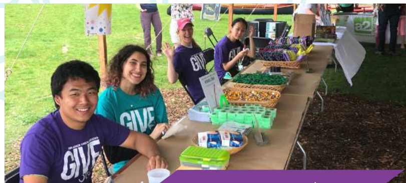
Huron River Day Volunteers