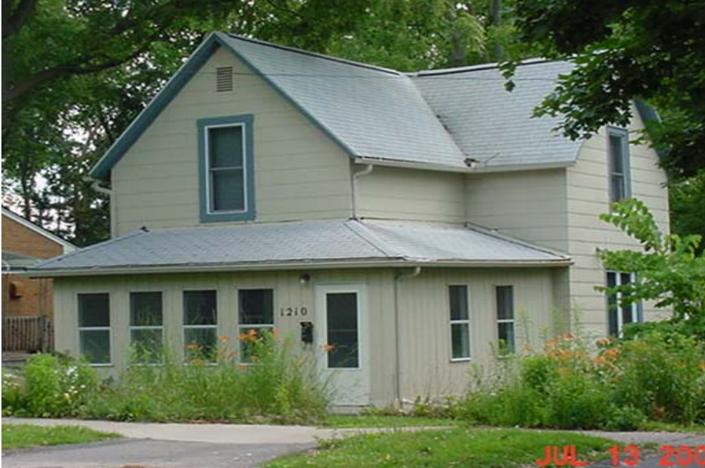
Figure 1 1210 Broadway Street, Charles Cox House, 1894, July, 2003