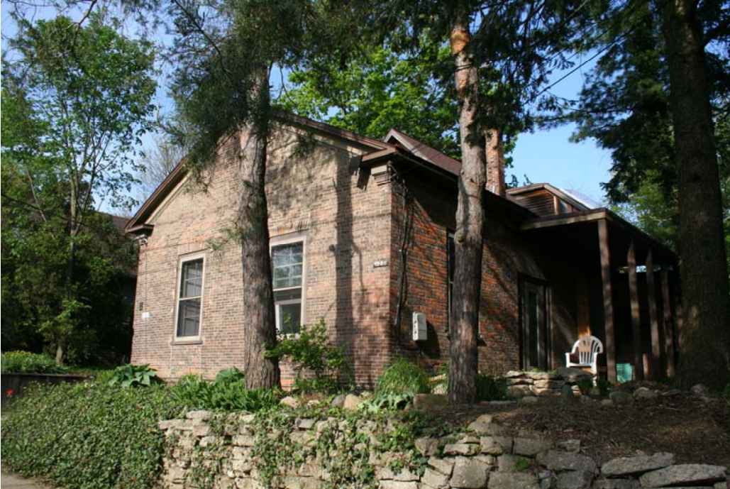
Figure 10 1202 Traver, District 16 School, 1841, May, 2007