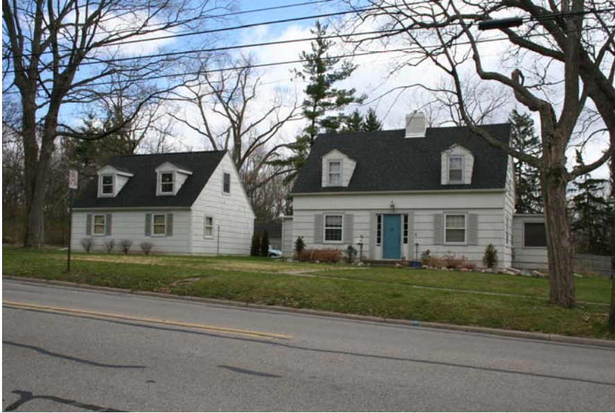
Figure 5 1628 Broadway, Travis Cash House, 1940, April, 2007