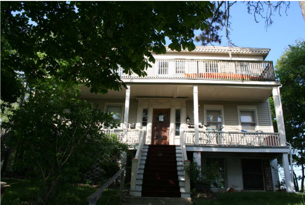
Figure 9 723 Moore, Kellogg House, 1838, May, 2007