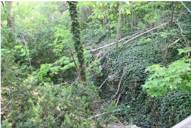
Figure 7 Plymouth Park looking south from near Traver, May, 2007