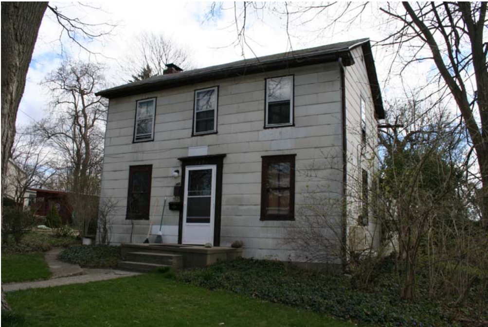
Figure 2 1324 Broadway, Zerah Pulcipher House, 1834, April, 2007