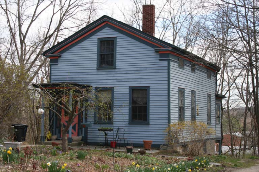
Figure 3 1418 Broadway, Mary Ann Tuttle House, 1853, April, 2007