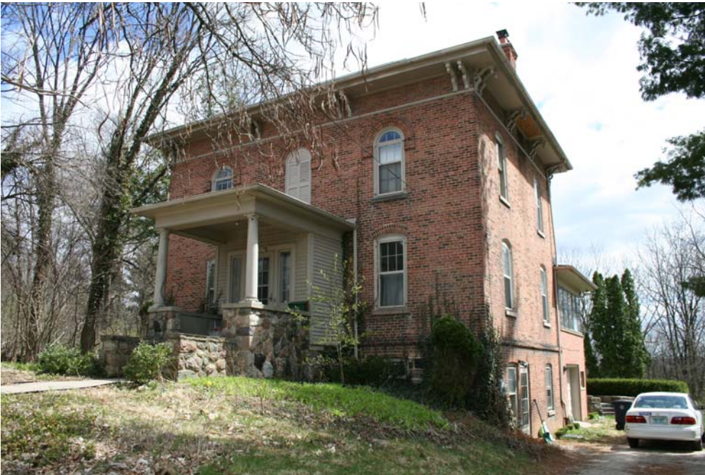
Figure 4 1510 Broadway, Jay Taylor House, 1862, April, 2007