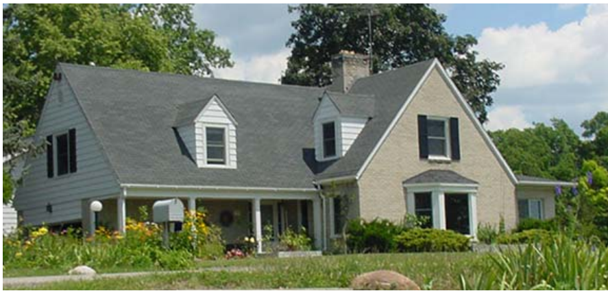
Figure 6 1500 Cedar Bend, Leo Haner House, 1939, July, 2003