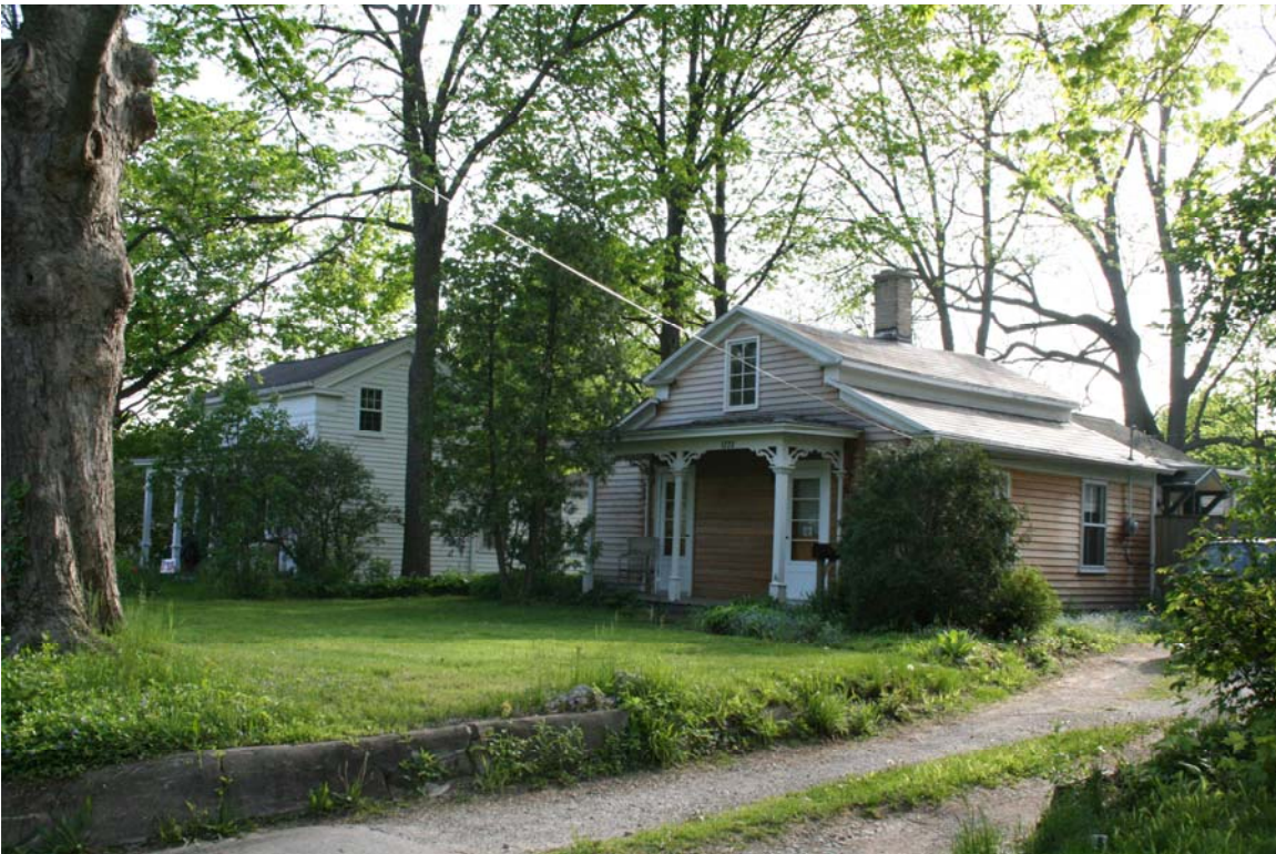
Figure 11 1219 and 1223 Traver, Solomon Armstrong and Jacob Armstrong Houses, 1851 and ca. 1840s, May, 2007