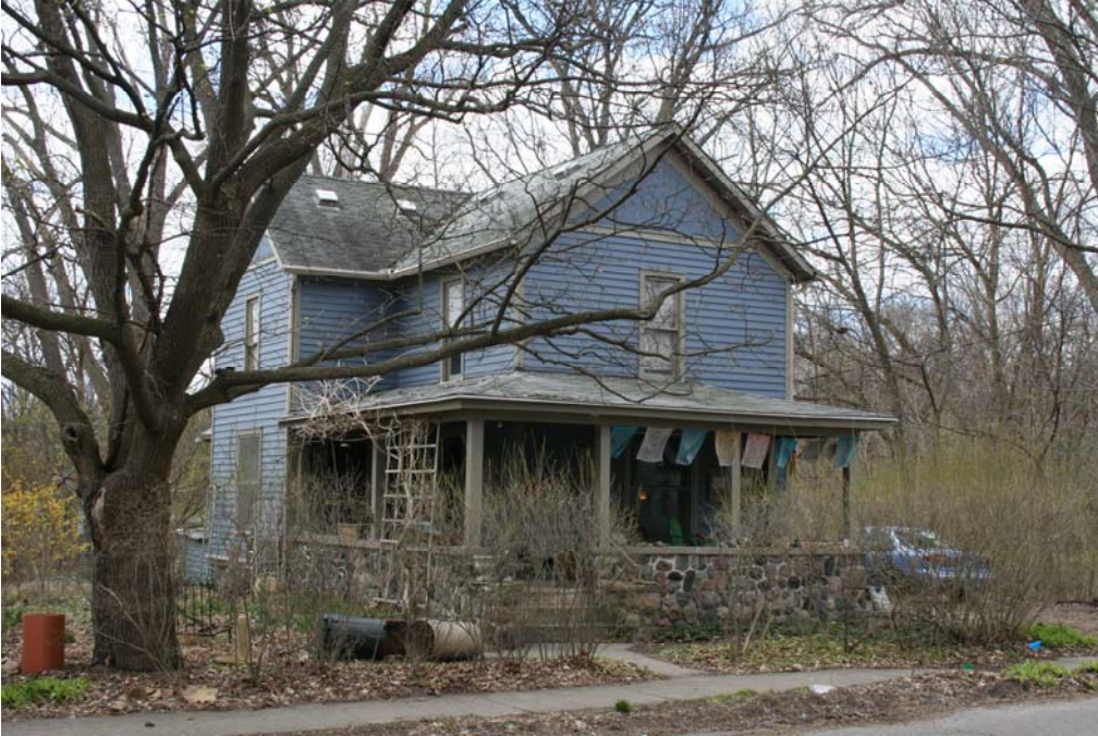
Figure 8 802 Jones, Christopher Wicks House, ca. 1894, April, 2007