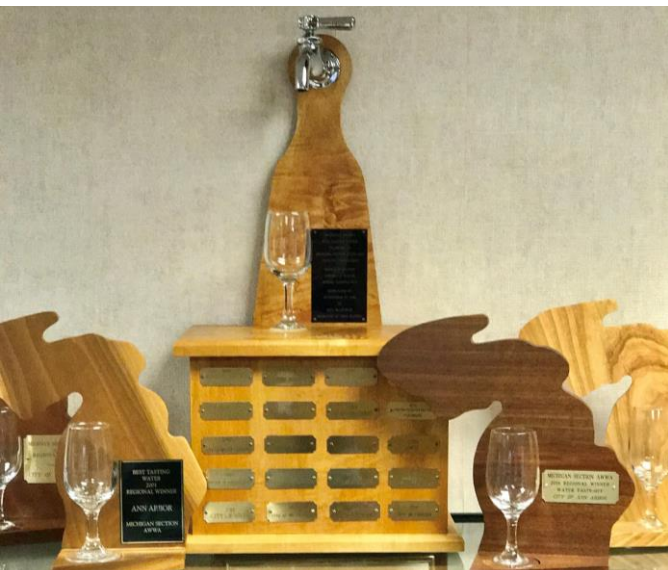
Best Tasting Water in Michigan 2016 Trophy

There are some exciting things that I would like to share with you; first, our drinking water won the title of Best Tasting Water in Michigan , an