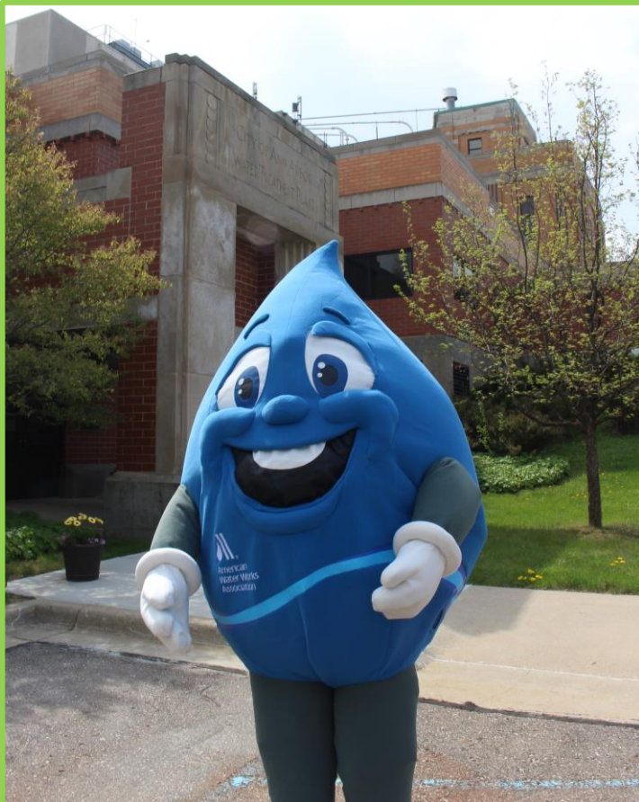
Eddie the Water Drop at the 2016 Open House