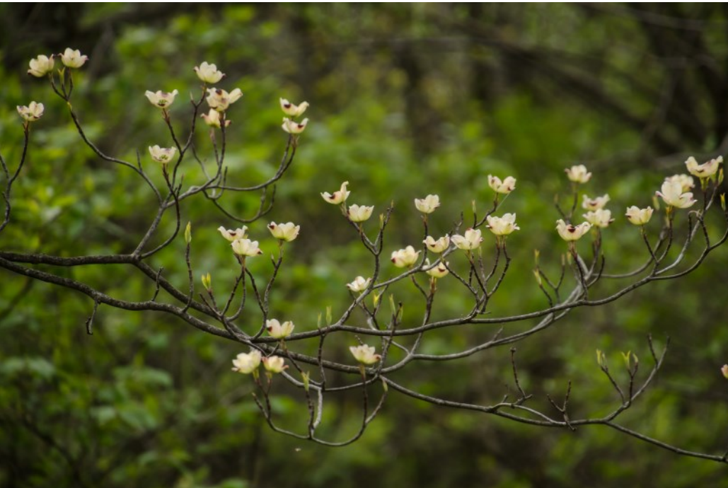
Flowering dogwood in bloom, Willow flowers, Hackberry bark

NAP's mission is to protect and restore Ann Arbor's natural areas and foster an environmental ethic within the community.