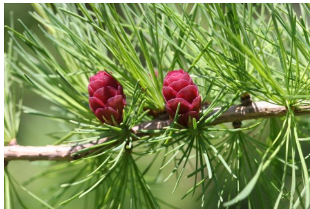
Larix laricina needles close up