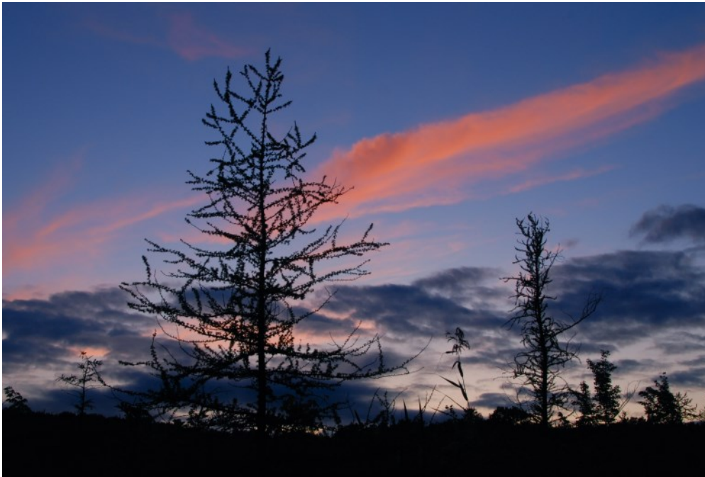
“Tamarack Sunset”, Thaddeus Hejka