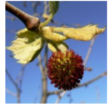
“Sycamore Flower”

London plane has fruits in clusters of two, while sycamore has solitary fruits. London plane loses more of the flaky outer bark, giving it a dull greenish brown appearance.