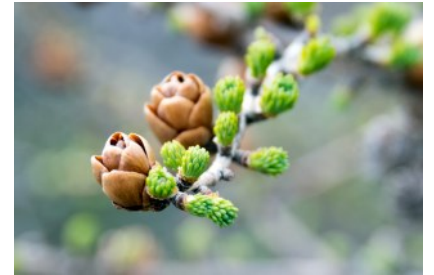
Larix laricina young cones