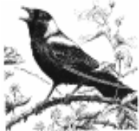
The Atlas of Breeding Birds of Michigan

A new building has been approved for the Leslie Science Center , resulting in some changes for NAP. We will have expanded office space upstairs in the main house of the science center, but the conservation crew will need to move its tools and supplies out of the honey house, or “shed” as we call it. Ground breaking is scheduled for this fall.