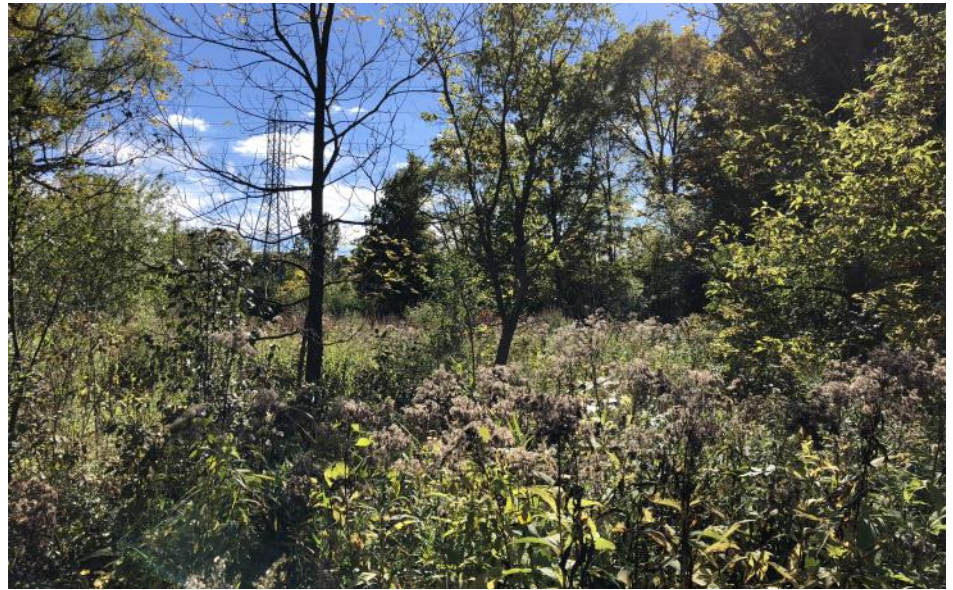
The fen at Foxfire West

But the workday is not why I'm here. This is my first time visiting this park and I want to see the fen. A fen is a peat-forming wetland, like a bog, except fens are fed by groundwater and are less acidic. This particular fen is a prairie fen, which are dominated by grasses, sedges, and wildflowers, and often