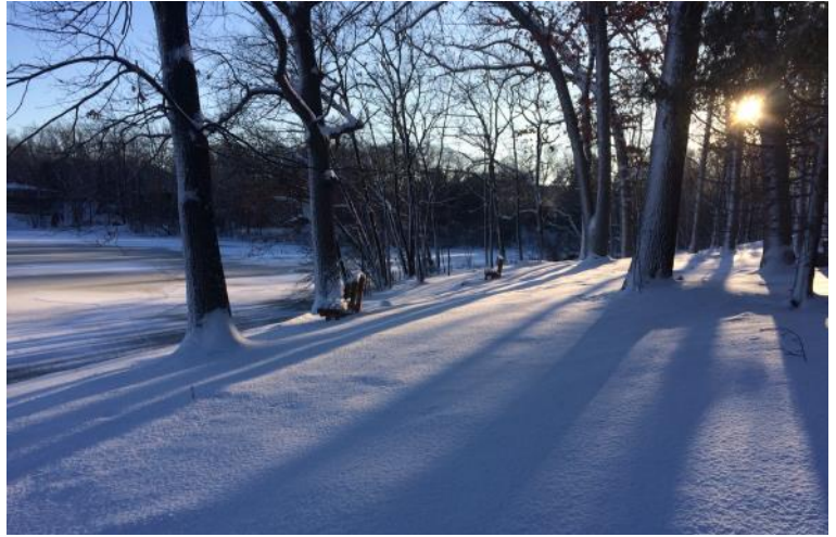
The sun rises over snowy South Pond Nature Area

Soon Mike pulls up, along with other NAP staff. Hunched around our steaming mugs in the main conference room, we run through our day's work. We're headed to Barton, where we'll push back the buckthorn and honeysuckle thickets encroaching on the high-quality prairie remnant near the railroad. While we're there, we can also nab a stand of black locust poles edging the railroad right-of-way.