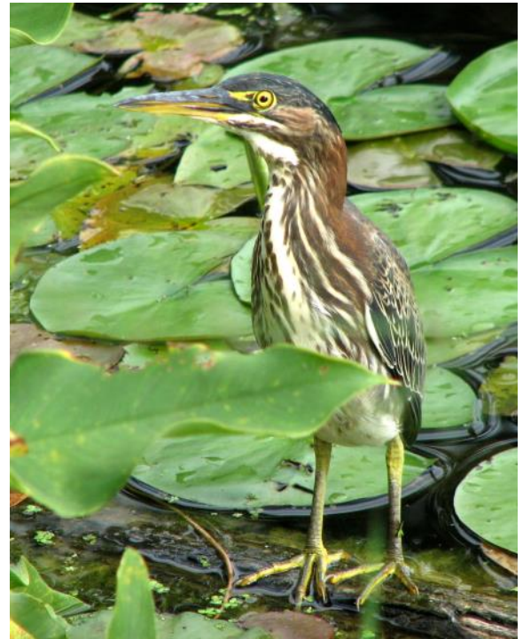
Green Heron, by Ralph Powell

The nature area is bordered to the west by Leslie Park Golf Course and to the east by Foxfire South Park. Surrounding Traver Creek Nature Area are eight parks and nature areas totaling about 300 acres which serve as a habitat corridor for native fauna and are the largest greenspace within the city of Ann Arbor.