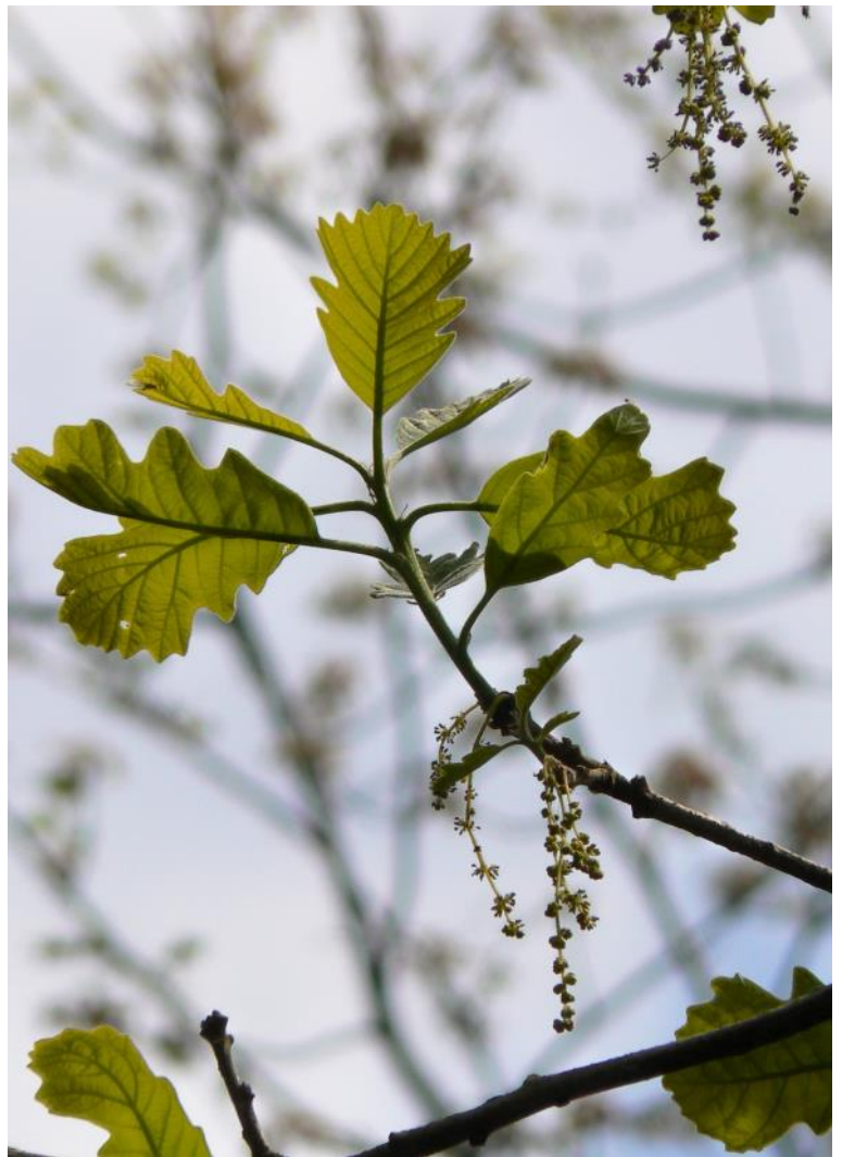
Bur Oak Flowers, by Harold Eyster

I f one were to go scouting now for any of these aforementioned species, they will find the task challenging. These birds and butterflies migrate south to overwinter. Luckily, just because it is winter does not mean nature has come to a standstill. While walking the trails of Traver Creek, one can see rabbits, Blue Jays, Downy Woodpeckers, and white-tailed deer amongst other fauna. The flora of winter is best expressed as trees beautifully weighted by fallen snow. The trees that are most distinguishable by their bark in winter include black cherry which ranges from 50-80 feet in height when fully mature. The bark is a dark grey/black and peels up in curved chunks resembling burnt potato chips. We also see shagbark hickory, which, while unique in appearance, is common to this area. Tree height can be