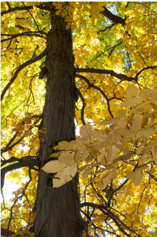
Shagbark hickory

taller than 100 feet at maturity. It has bark that peels up in long strips and has a distinctly 'shaggy' appearance.