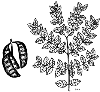
Susan Jackson Karstrom 1955 Kentucky Coffee-Tree

Leaves are bipinnately compound with leaflets arranged along both sides of a common midrib, each branching from a main midrib (See illustration). Its fruit is a legume (pod) with large rounded seeds inside.